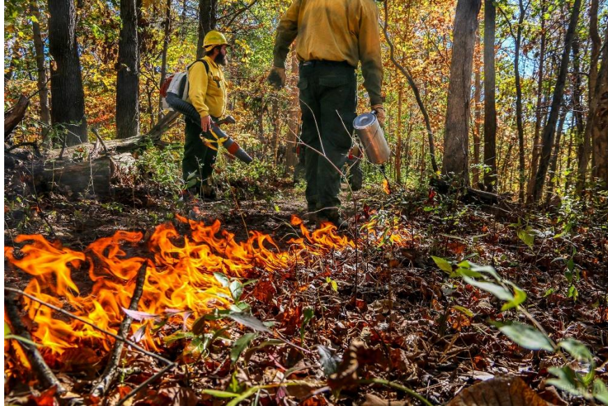
Figure 6. Rx burn targeting undesirable species including bush honeysuckle.

area. Prescribed burns are not enough on their own and will require follow up herbicidal treatments. Landowners should consult professionals when planning and implementing prescribed burns. Please see more information on prescribed burning on the prescribed burning and firebreak establishment section.