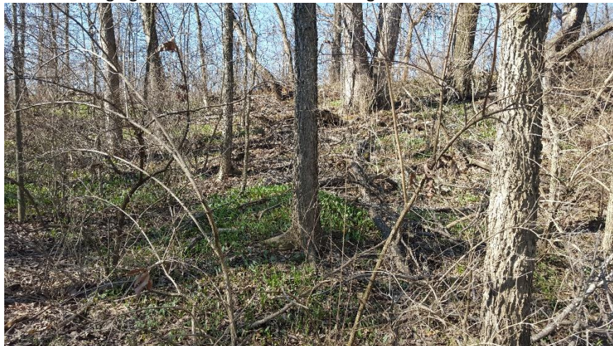
Figure 2. Trout Lilies emerging from the forest floor following foliar treatment of Asian Bush Honeysuckle.

Foliar Treatment – Foliar treatments are conducted by spraying the entire surface area of the plant to defoliate it. This treatment should be conducted prior to the flowering of the species each year to prevent additional seed crop from that species. Foliar treatments oftentimes need to be conducted several years in succession in order to achieve control. Methods used for foliar spraying include hand-pump spraying, back-spraying, aerial (helicopter) or mechanical spraying (ATV sprayer, boom sprayer). This method tends to be less labor intensive than other methods, but more follow up treatments are necessary to achieve control. Chemical often used in foliar spraying include Roundup (Glyphosate) and Garlon 3A (Triclopyr). Other chemicals may be used. Using a dye is generally recommended to ensure proper coverage is occurring. Surfactants are often added to increase surface coverage and stickiness of the herbicide. Late fall or early spring, when native vegetation does not have leaves, is preferred for this treatment to reduce or eliminate damage to actively growing natives. Please contact your local chemical dealer about other chemicals. Follow all label directions for the chemicals selected.