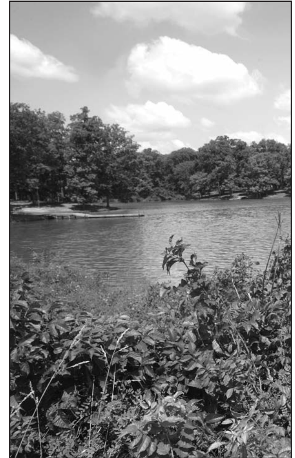
LAKE BOAT DOCK