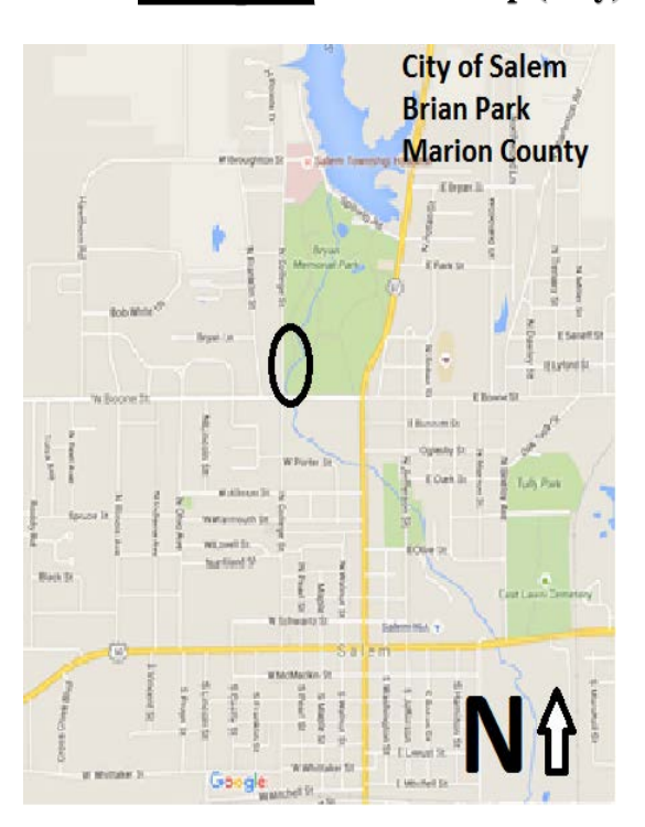
Example: Location Map (City)