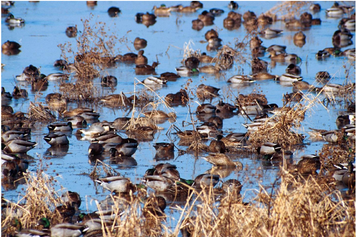
Foraging ducks. Note the mix of grasses and broad-leaved forbs (darker brown color) and shallow water (ducks can feed without tipping up). Feeding dabbling ducks prefer water less than 18 inches, but 6-8 inches or less is ideal.

Another important management tool is soil disturbance. After several years without disturbance, moist-soil plant growth may become less vigorous, woody species may start to encroach, and undesirable perennial species which do not produce as much seed will become more common. Disking, either lightly or heavily, sets back succession, reduces less productive perennial species, reduces woody species and exposes seed in the underground seed bank which can invigorate a wetland.