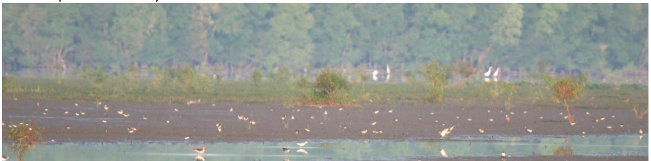
Shorebirds will use exposed mudflat extensively during their migration periods (April–June and July–October).

Some managers recommend heavy disking in moist-soil wetlands every 3-4 years to ensure maximum seed production. Other management to prevent encroachment of woody species or other undesirable species may include mowing, prescribed fire or herbicide application. Deeply flooding a wetland through a growing season may also provide disturbance, drown out some susceptible species, and result in a different plant community or more marsh-like conditions.