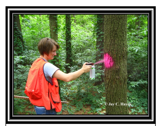
This independent professional consultant forester was hired to conduct a thorough forest inventory; prepare a forest management plan; determine the owner's timber cost-basis for tax reporting and accounting purposes; and mark, market, administer, and monitor a timber sale for an Illinois forest landowner.

GPS & GIS Mapping Services: consultants who provide quality mapmaking services utilizing the latest GPS and GIS technology.