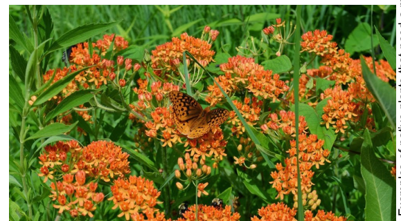
Examples of native plants that need a more open forest: serviceberry, bee balm and butterfly milkweed