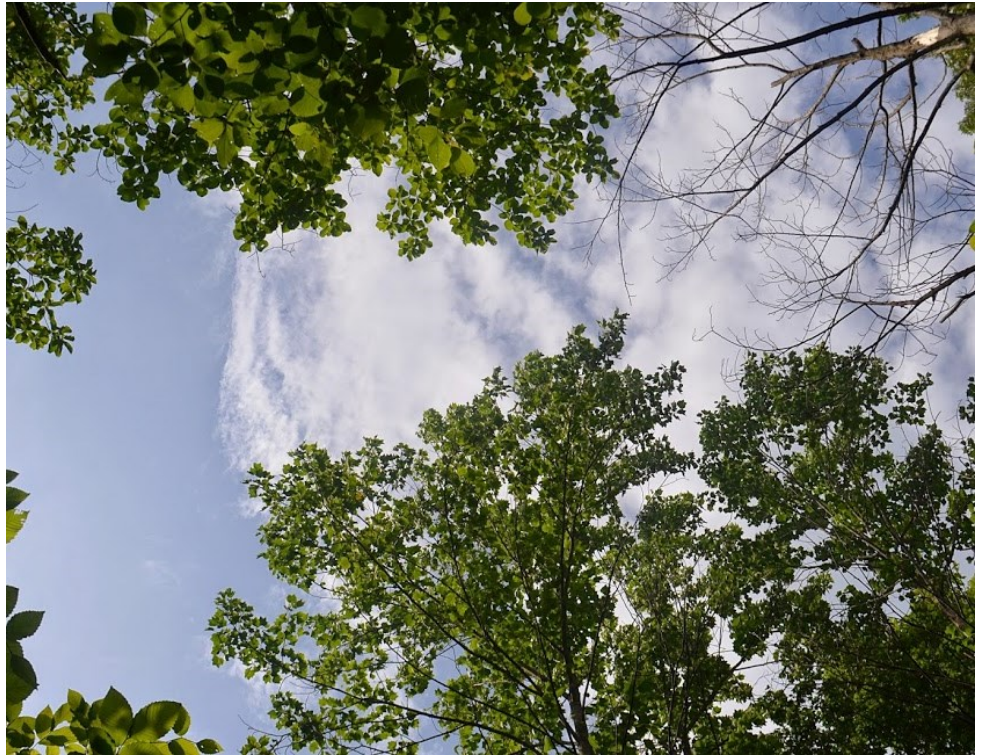
open forest canopy

Given the loss of oak in the forest's overstory and the lack of oak saplings, it is unlikely that this keystone species group will maintain its historic numbers without active management.