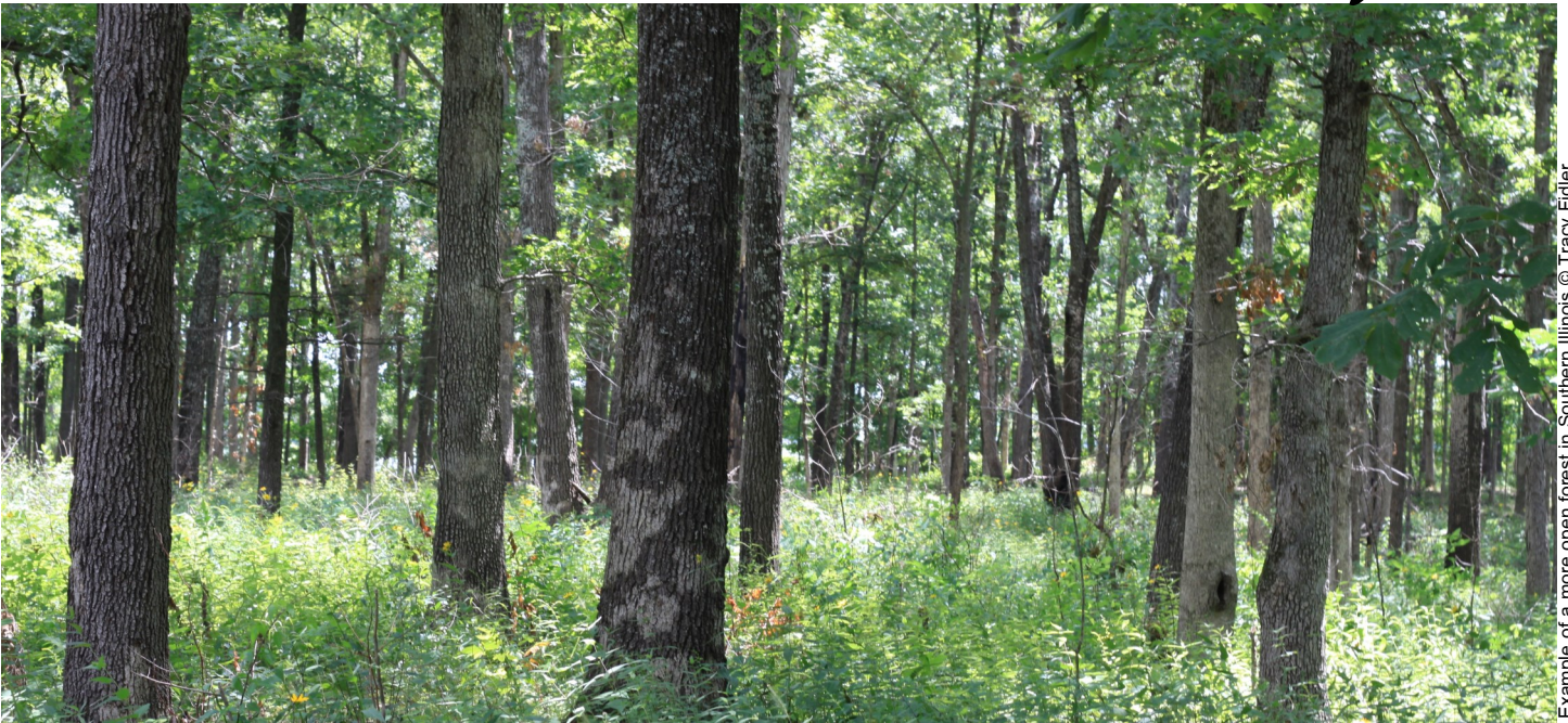
Example of a more open forest in Southern Illinois