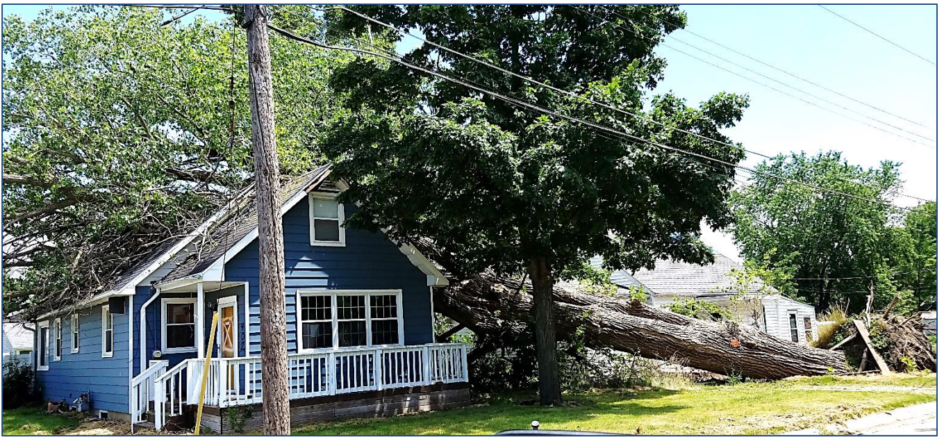
Severely damaged house from a large tree that fell from the February 28 th tornado.