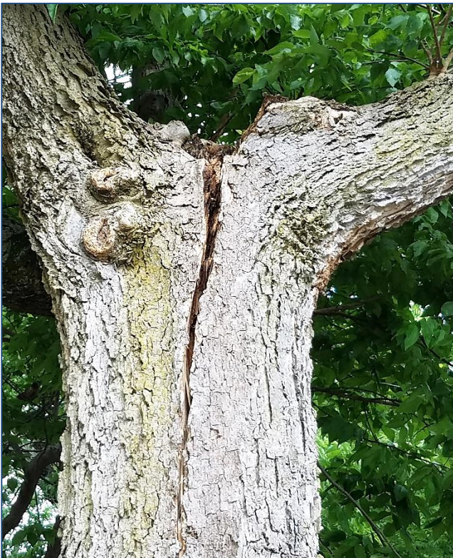
Tornado in Ottawa nearly split this tree in half

after a storm to conduct a Level I Rapid Tree Risk Assessment to assist Illinois communities in identifying potential risk associated with storm ridden trees. Twenty-five people received Strike Team Specialist designation after Illinois' training.