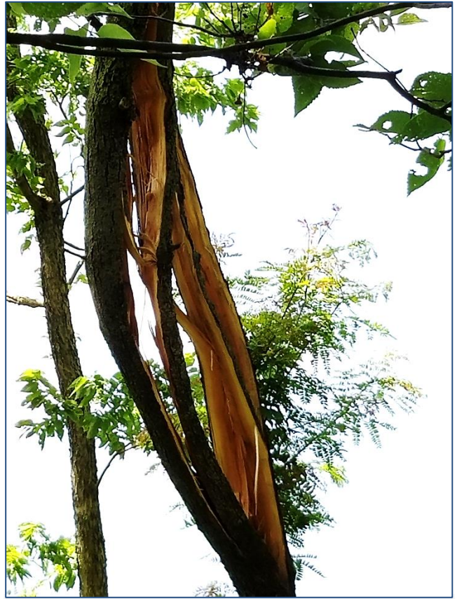
Twisted limb from the February Storm

Illinois became involved in 2013 through a partnership with the Illinois Arborist Association and the USDA Forest Service and IDNRUCF put on its first strike team training. The participants had to be International Society of Arboriculture Certified Arborist or equivalent, complete two FEMA courses, and the USDAFS Strike Team Intuitive webinar before they could be accepted into the week-long field training. The course enabled the team to go into a community