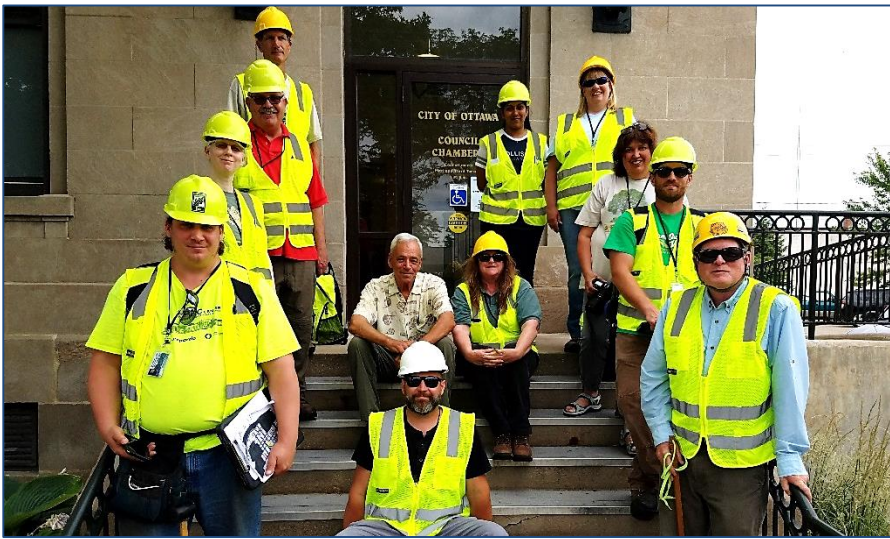
Team members of the Urban and Community Forestry Strike Team in Ottawa Illinois