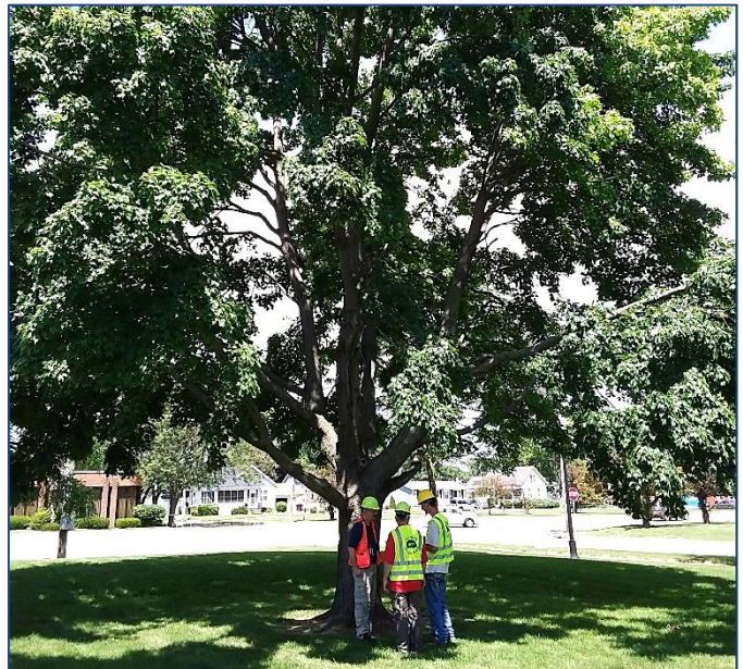
Strike team members compare notes under an undamaged tree

Left behind. Ottawa City Hall was the headquarters. The first day was logistics - equipment checked out, a refresher course taken, and temporary police Department issued ID badges were secured. The team members used the International Society of Arboriculture’s Best Management Practices and Tree Risk Assessment Qualifications (TRAQ) Protocols. FEMA protocols for assessing trees for removal and pruning were also used, reviewed, and discussed prior to field deployment. The FEMA criteria includes: percent of canopy loss, heartwood exposure, issues with scaffolding and branches, and stumps or root plate failure.