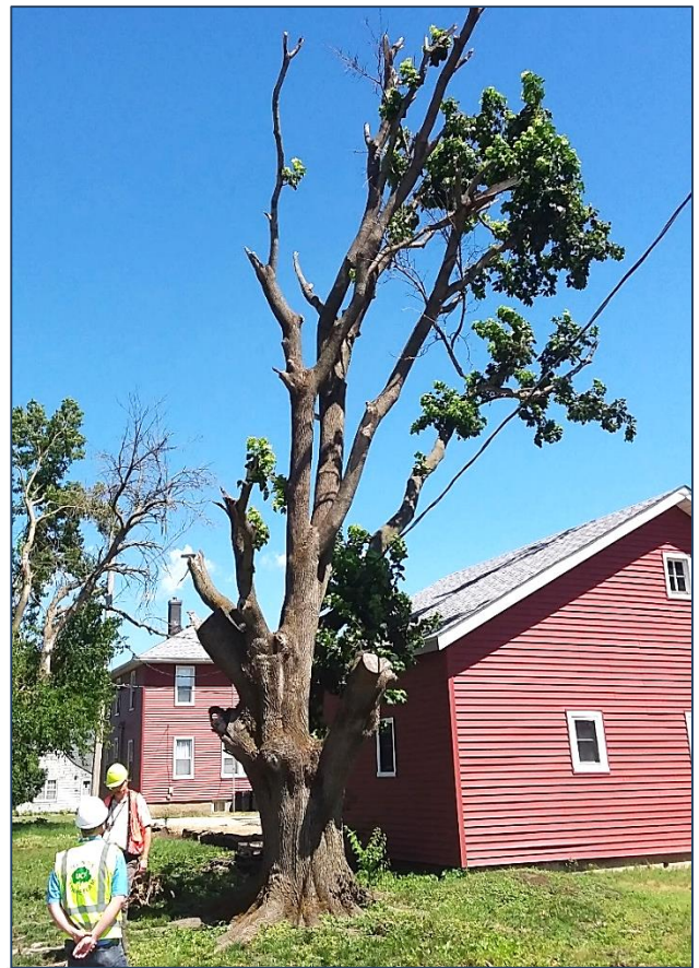
FEMA guidelines looks at percent of canopy in determining tree removal potential

While the Strike Team Specialists work is done once they hand the data to IDNR and return their equipment, the work of the IDNR and its partners is just beginning. The data must be quality checked by IDNR and a report written and given to the community.