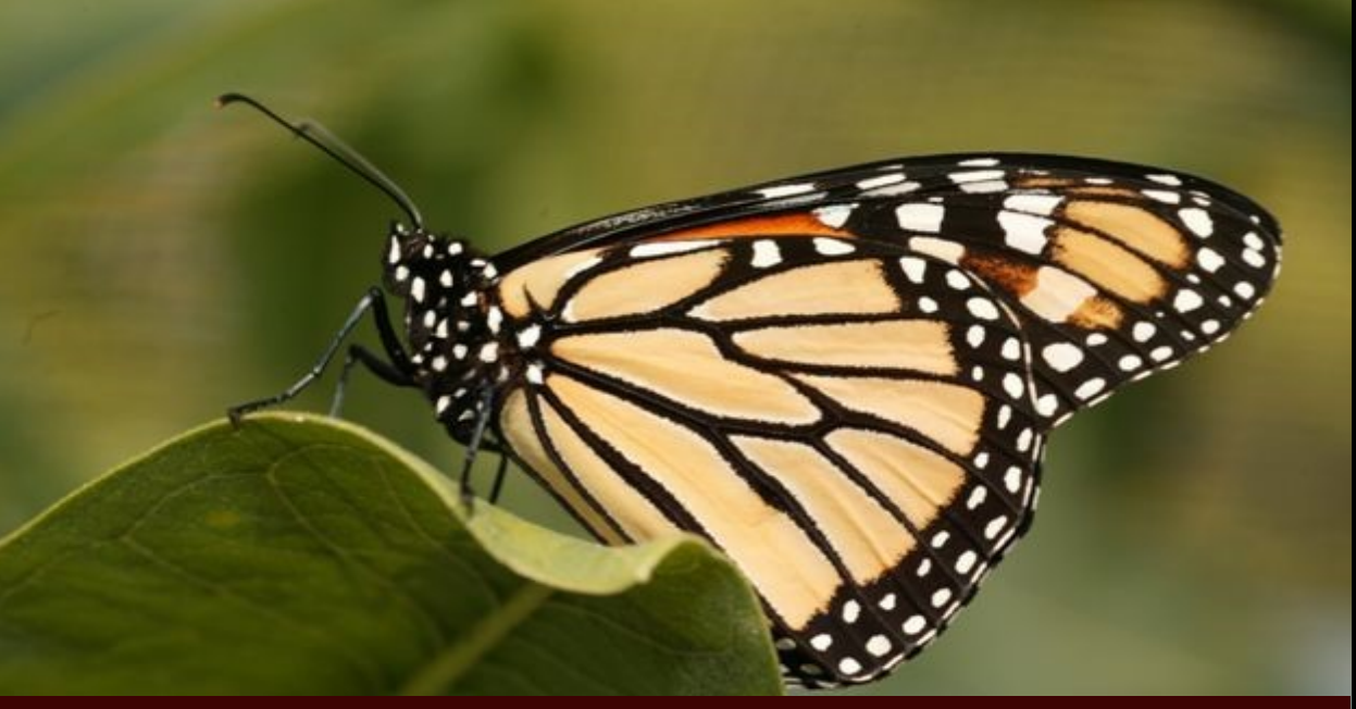
Farmland & Prairie Campaign