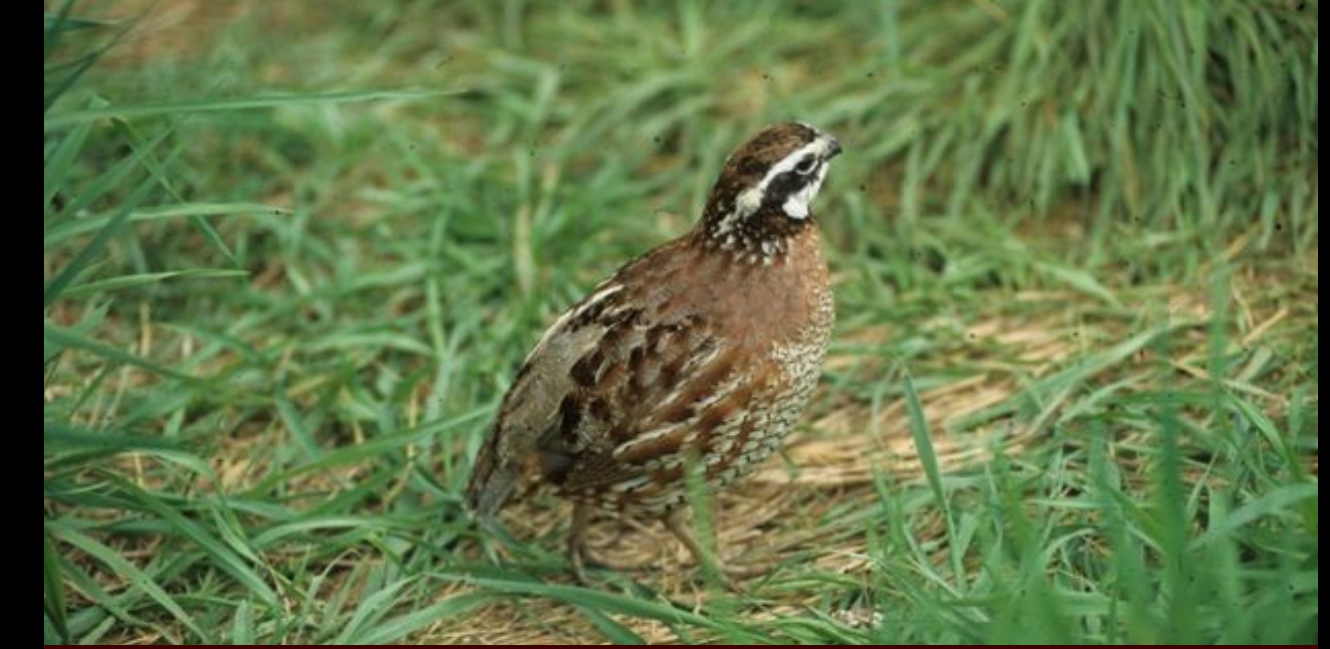
Farmland & Prairie Campaign

Northern Bobwhite ( Colinus virginianus )