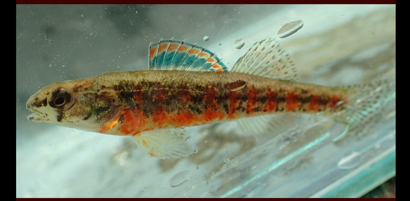
Lake Michigan & Coastal Area Campaign