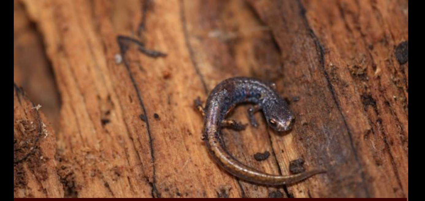
Forest & Woodland Campaign

Four-toed Salamander (Hemidactylium scuta-