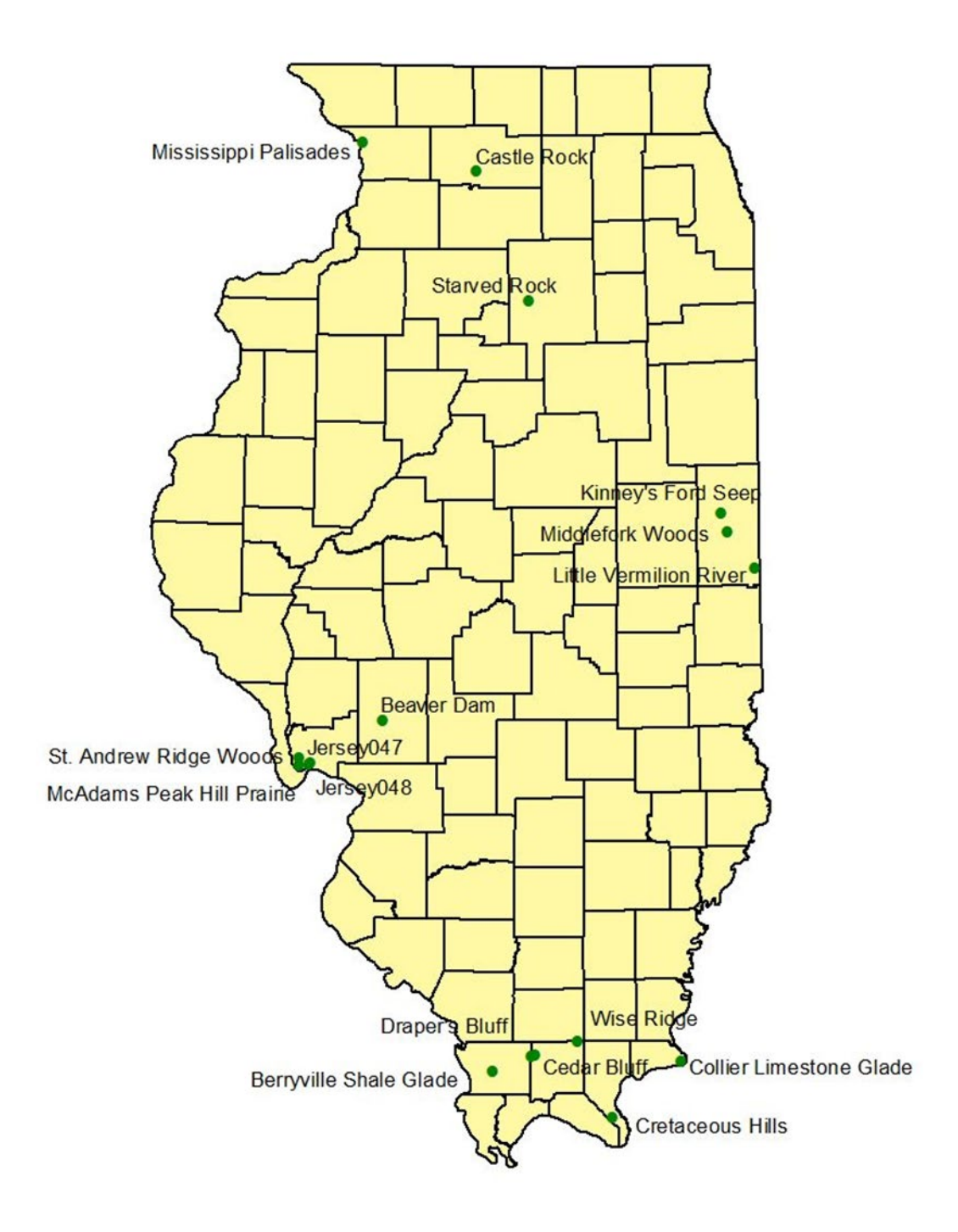
Figure 1. Sites included in the Public Lands Forest and Woodlands SWG, T-84-D-1 were scattered across Illinois