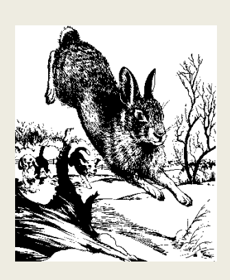
Prepared by Bob Caveny 09/20 Illinois Department of Natural Resources Division of Wildlife Resources

4 per day with 10 in possession after the 3<sup>rd</sup> day