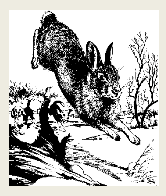
Prepared by Wade Louis 8/25 Illinois Department of Natural Resources Division of Wildlife Resources

4 per day with 10 in possession after the 3<sup>rd</sup> day