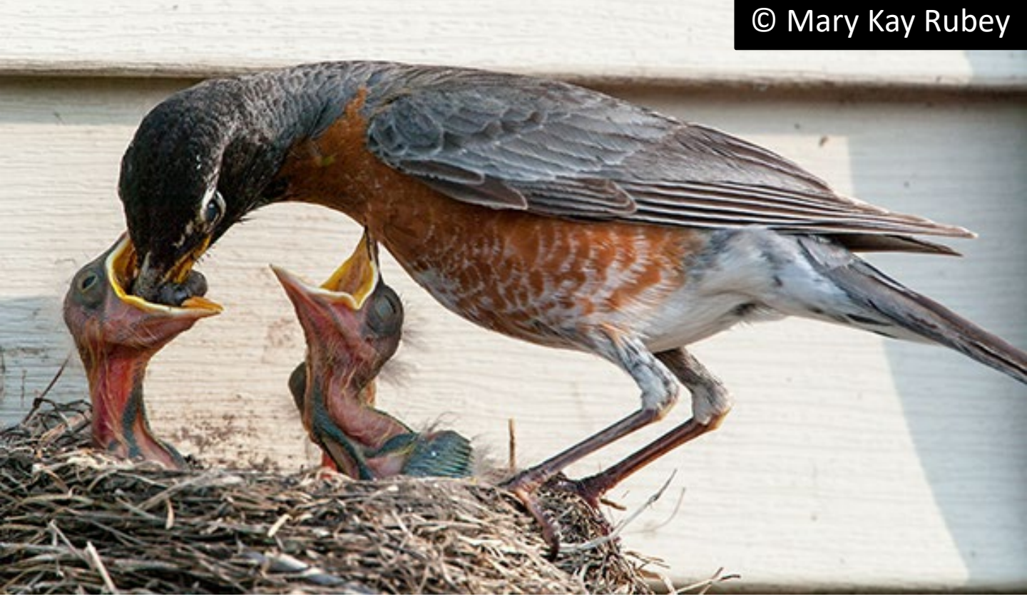
adult at nest