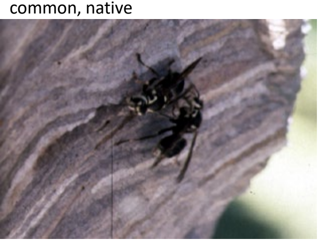
adults adding to nest layers