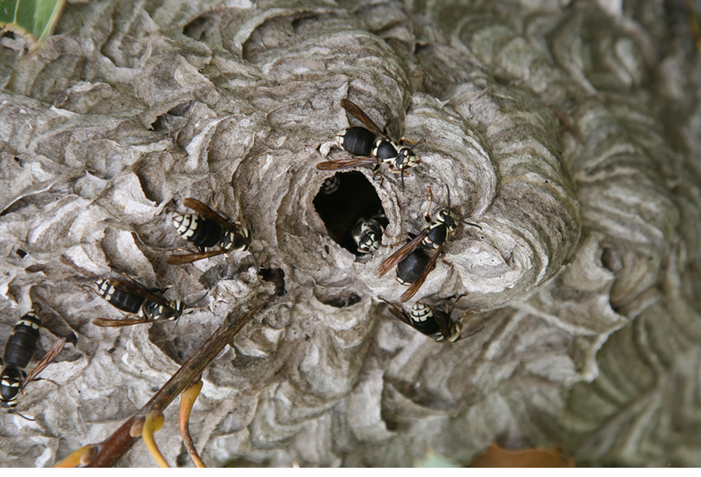
adults at nest