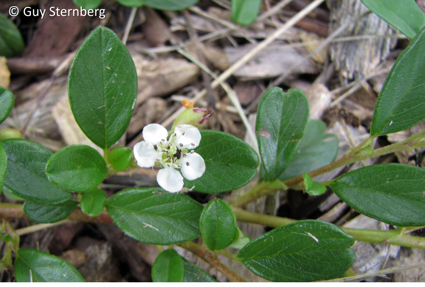
plant with flower