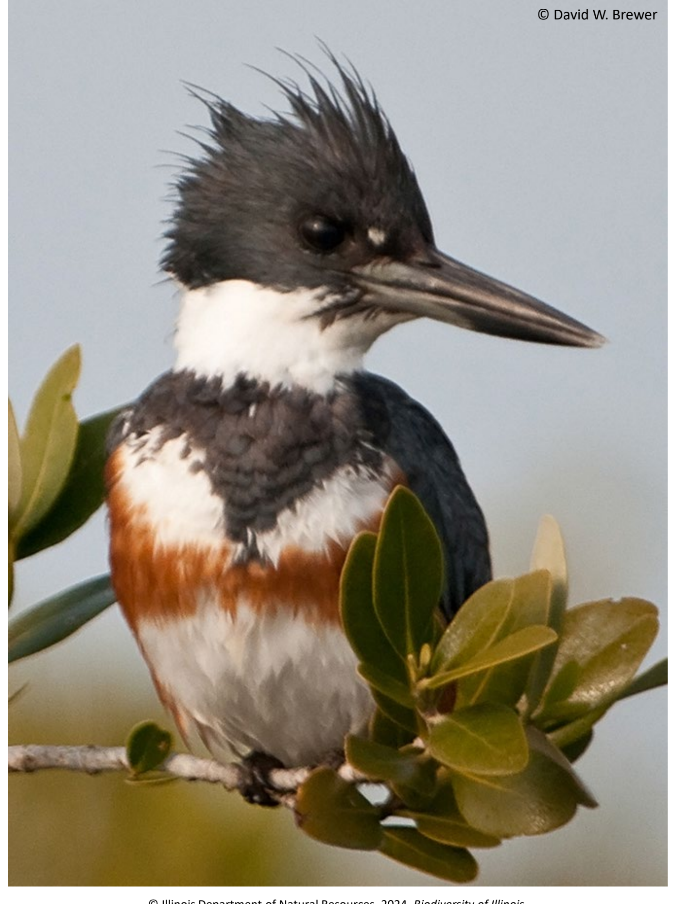
© Illinois Department of Natural Resources. 2024. Biodiversity of Illinois .