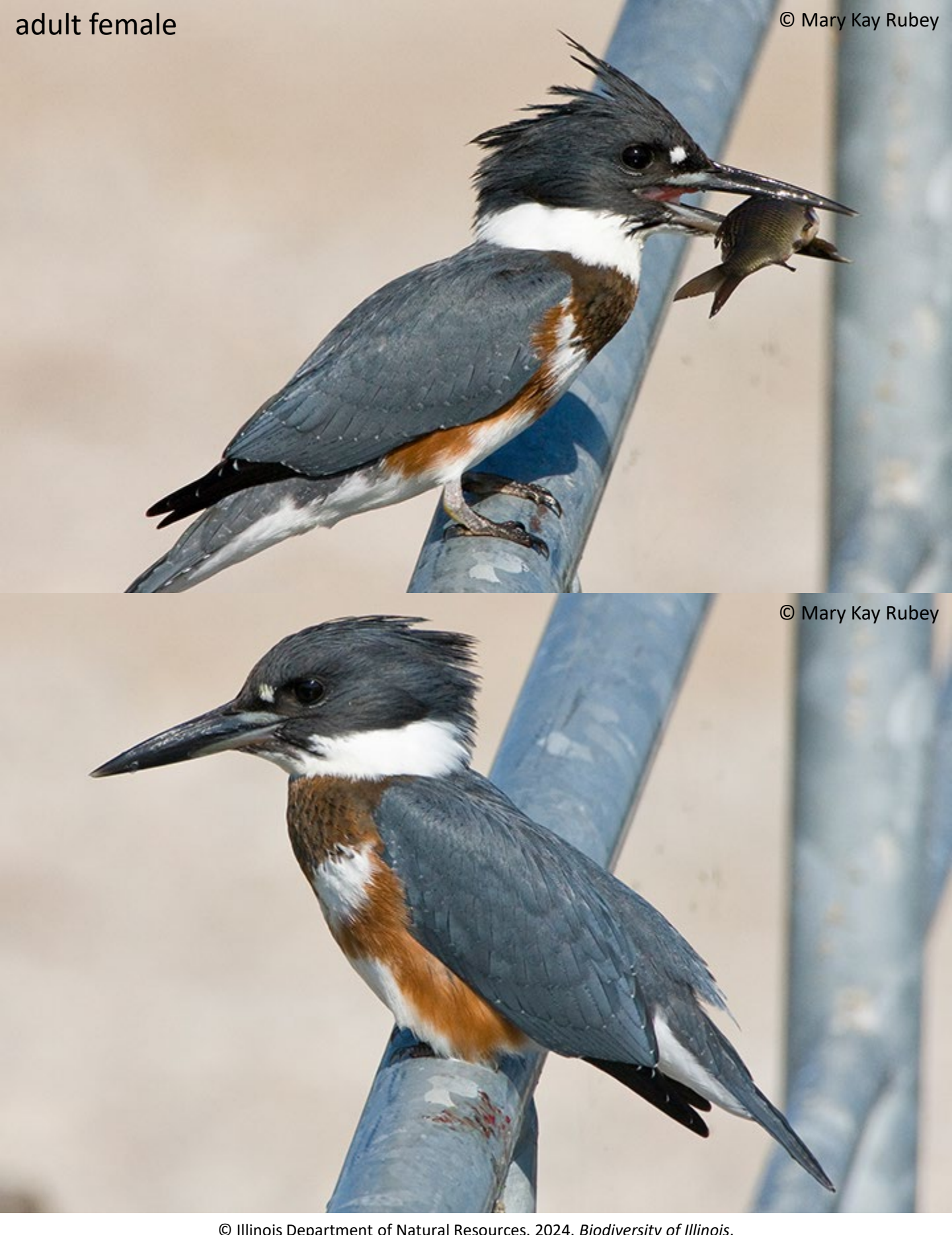
© Illinois Department of Natural Resources. 2024. Biodiversity of Illinois .