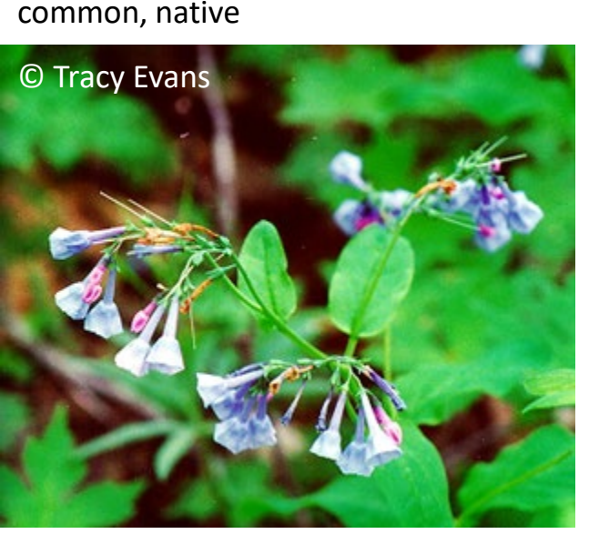
plant with flowers