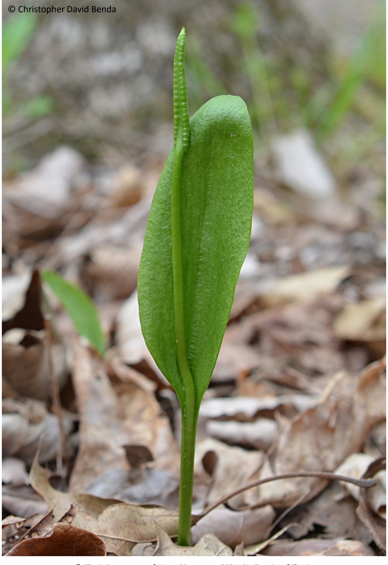
© Illinois Department of Natural Resources. 2021. Biodiversity of Illinois .