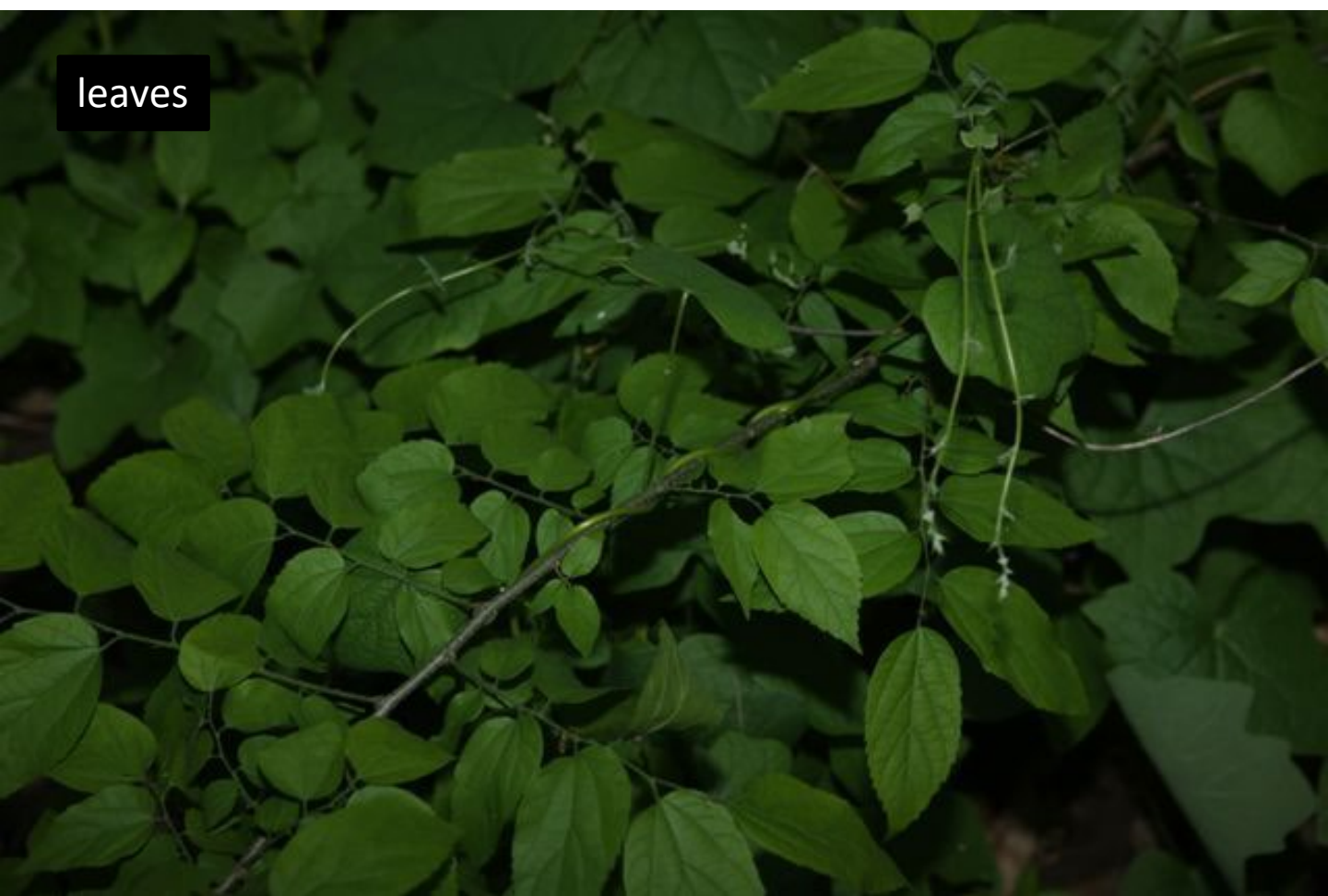
© Illinois Department of Natural Resources. 2024. Biodiversity of Illinois .