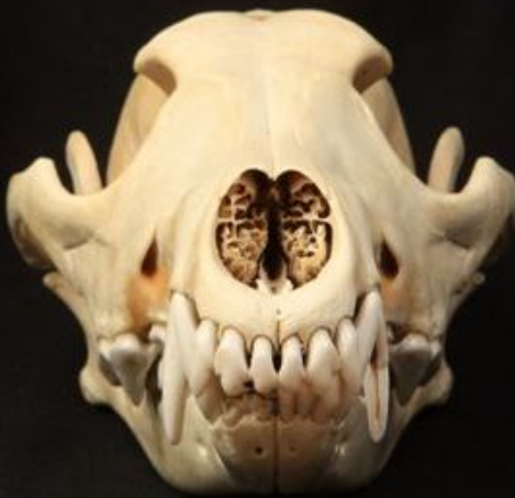
skull frontal view