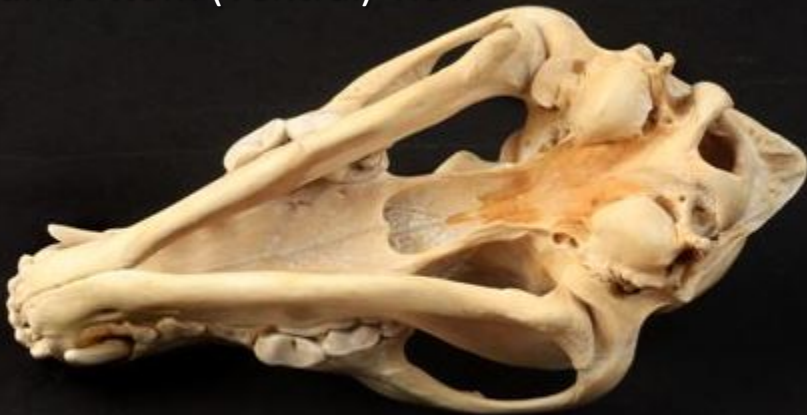
skull bottom (ventral) view