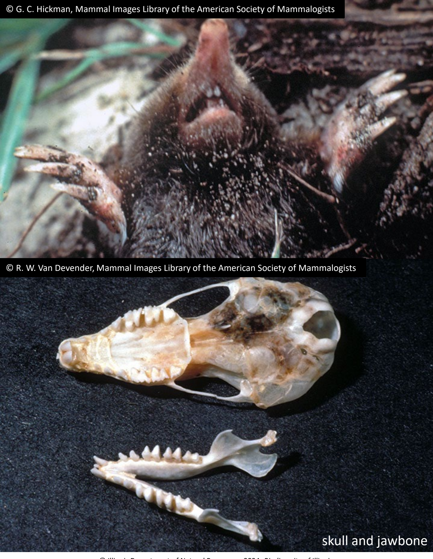
© Illinois Department of Natural Resources. 2024. Biodiversity of Illinois .