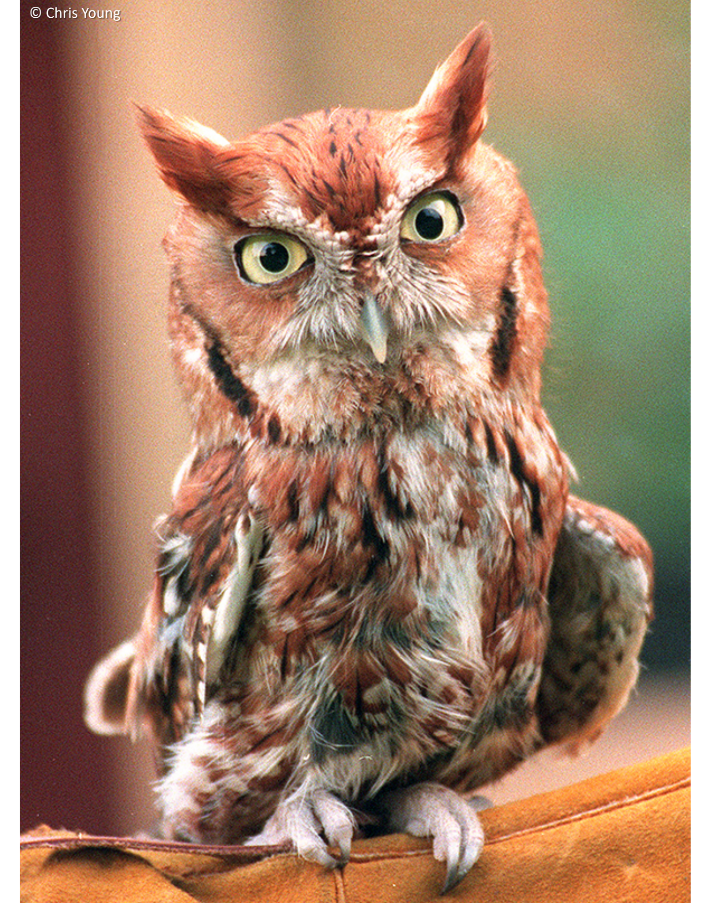
© Illinois Department of Natural Resources. 2020. Biodiversity of Illinois .