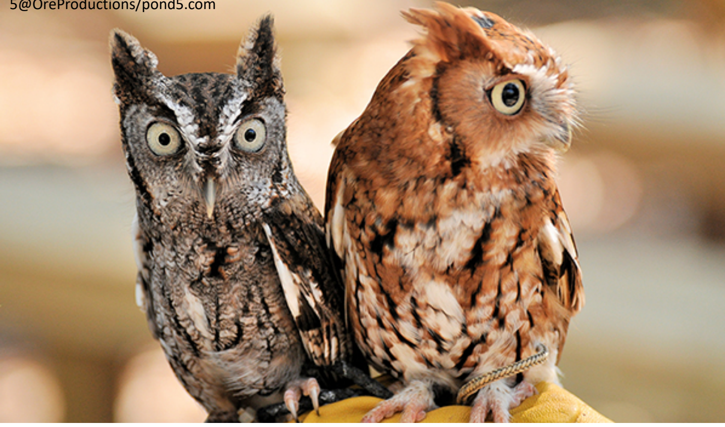
gray and red phases