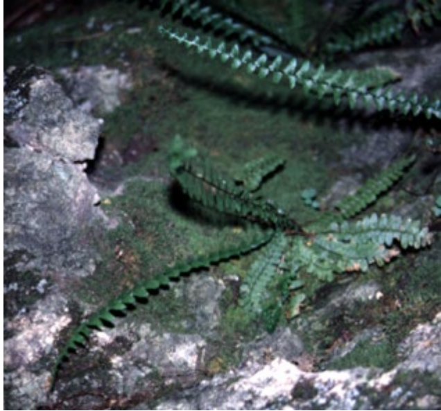
growing on rock