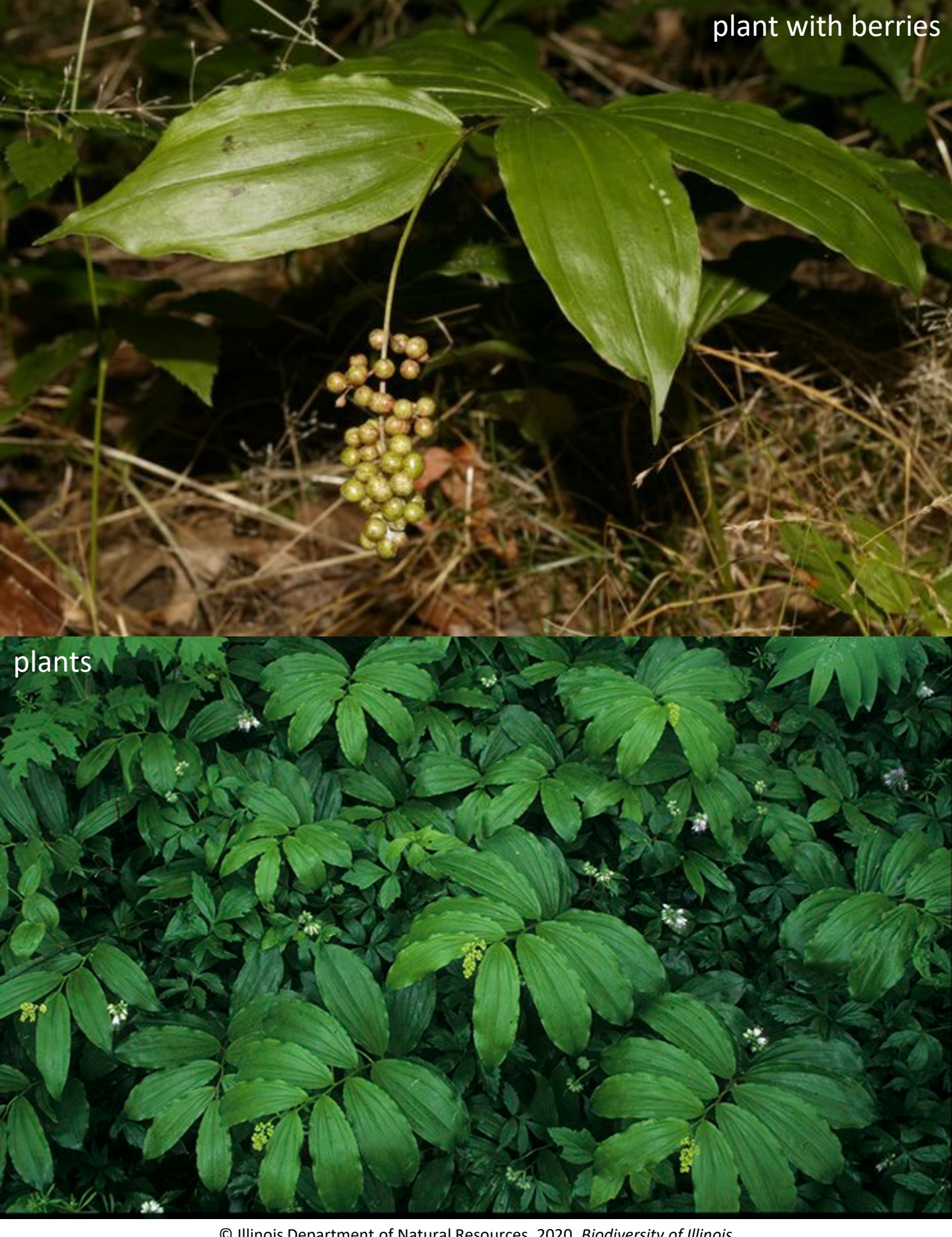
© Illinois Department of Natural Resources. 2020. Biodiversity of Illinois .