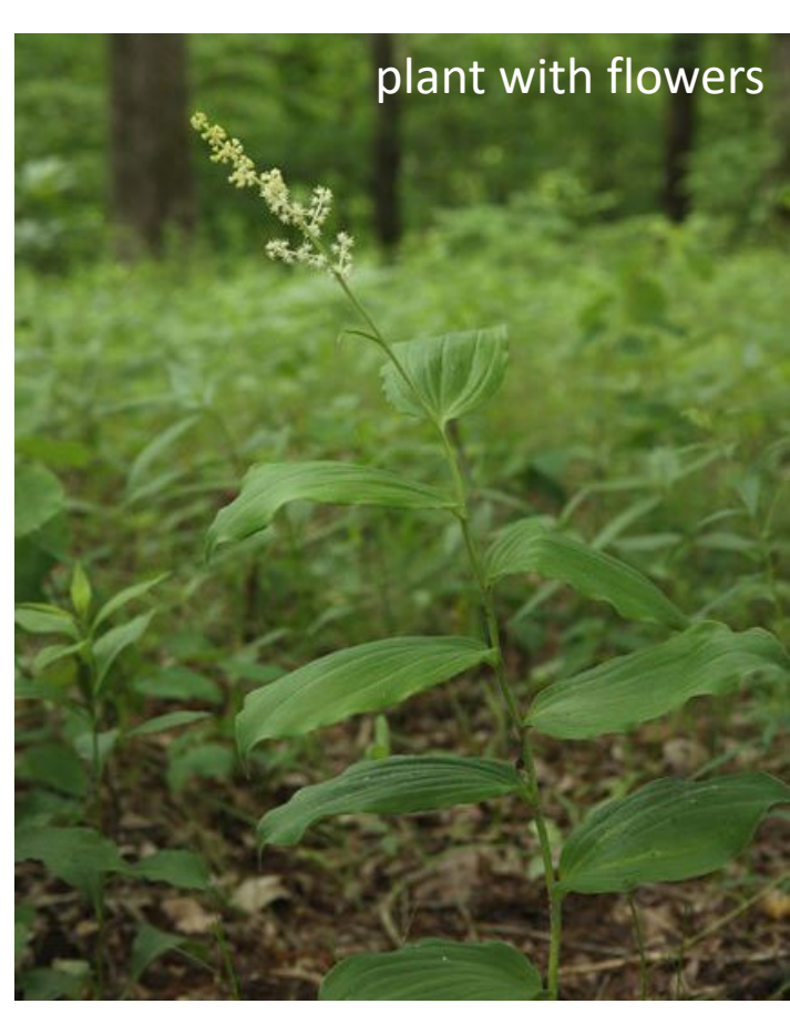
© Illinois Department of Natural Resources. 2020. Biodiversity of Illinois . Unless otherwise noted, photos and images © Illinois Department of Natural Resources.

False Solomon's-seal may be found statewide in Illinois. This plant grows in rich, moist woods. False Solomon's-seal flowers from May through early June.