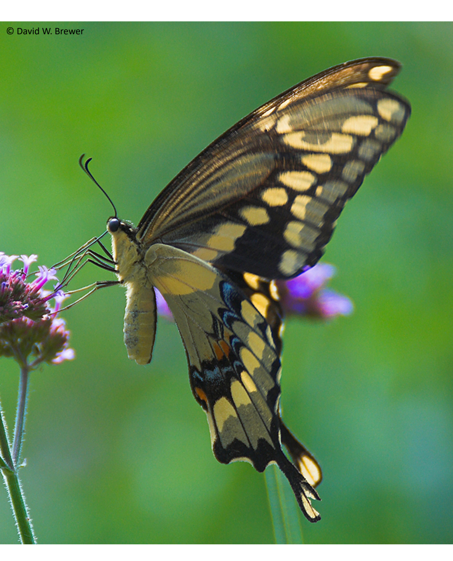
© Illinois Department of Natural Resources. 2020. Biodiversity of Illinois .