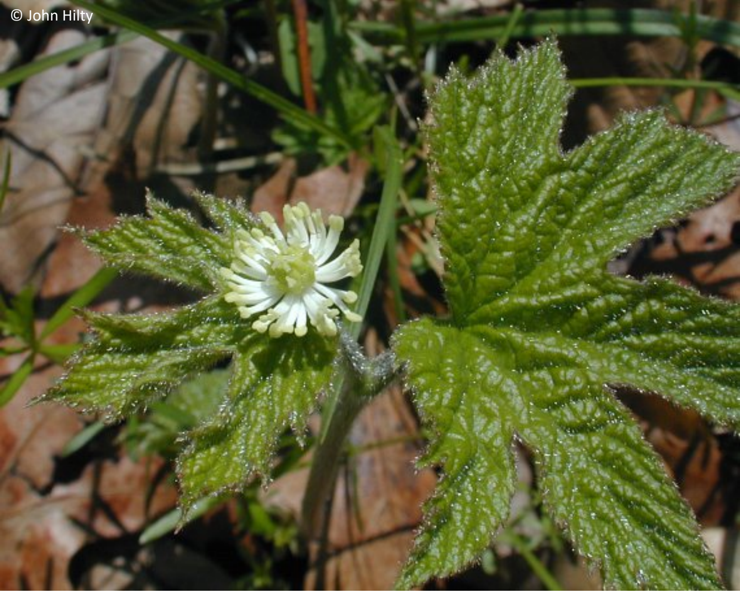
upper leaves and flower