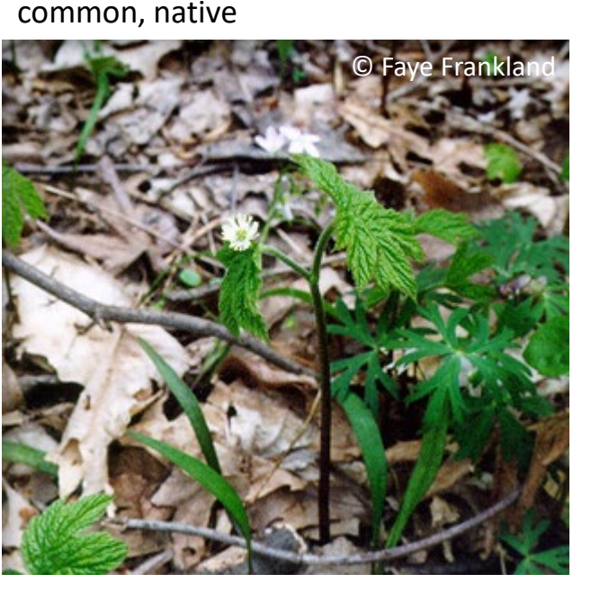
plant with flowers