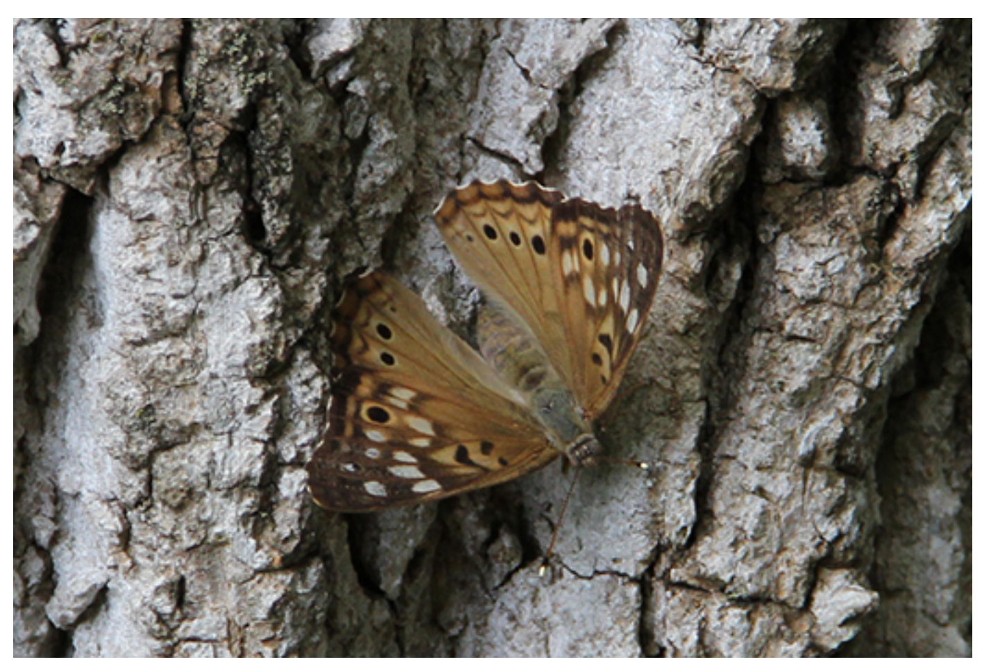
© Illinois Department of Natural Resources. 2020. Biodiversity of Illinois . Unless otherwise noted, photos and images © Illinois Department of Natural Resources.