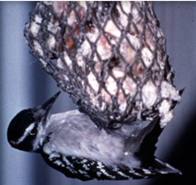
adult at suet food

The hairy woodpecker is a common, permanent resident statewide. Nesting takes place from March through June. The nest cavity is dug five to 30 feet above the ground in a dead or live tree. Both sexes excavate the hole over a one- to three-week period. The female deposits three to six white eggs on a nest of wood chips. The male and female take turns incubating the eggs during the day, with only the male incubating at night for the duration of the 11- to 12-day incubation period. One brood is raised per year. The hairy woodpecker lives in woodlands, wooded areas in towns, swamps, orchards and city parks. Its call is a loud “peek.” This woodpecker eats insects, seeds and berries.