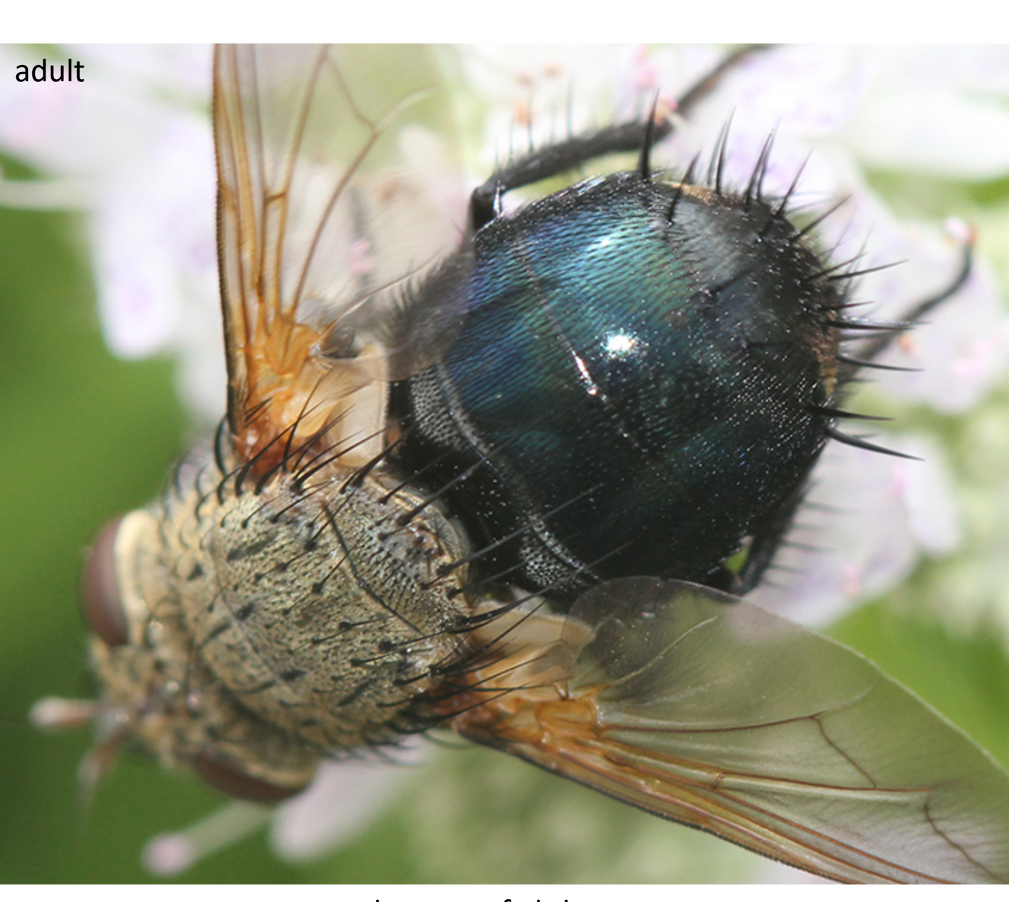
close-up of abdomen