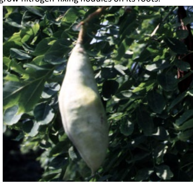
fruit and leaves

The Kentucky coffee tree may be found statewide in Illinois. It grows in low woods. Flowering occurs from May through June. The wood is used for fence posts, as fuel, for making cabinets and for railroad ties. The seeds can be used as a substitute for coffee, however, the pulp is poisonous. This plant is one of the few members of the pea family that does not grow nitrogen-fixing nodules on its roots.