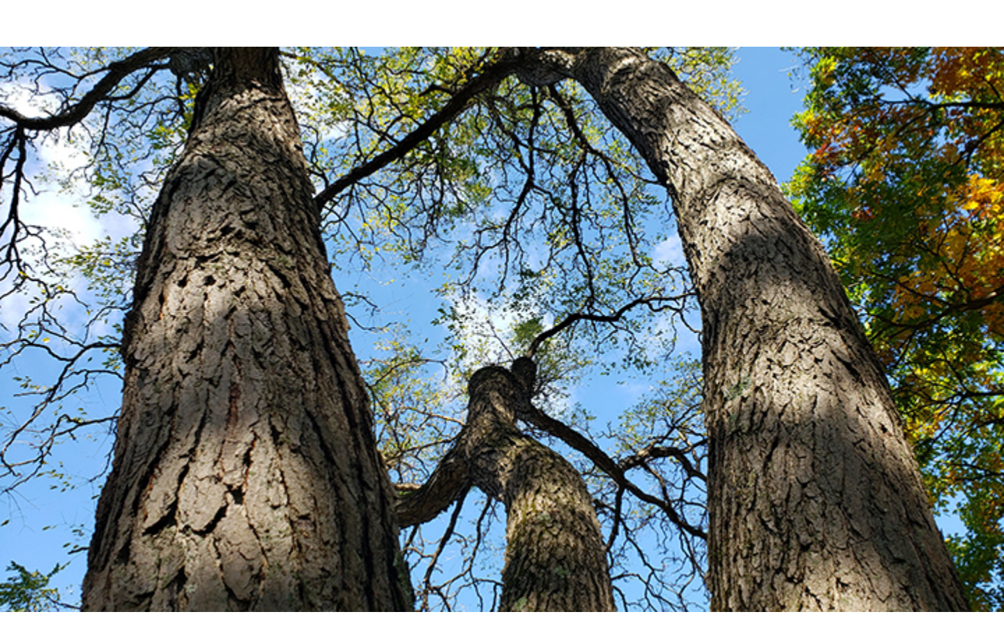
© Illinois Department of Natural Resources. 2021. Biodiversity of Illinois . Unless otherwise noted, photos and images © Illinois Department of Natural Resources.