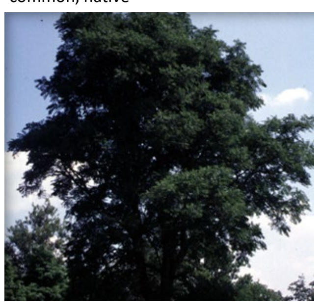
tree in summer