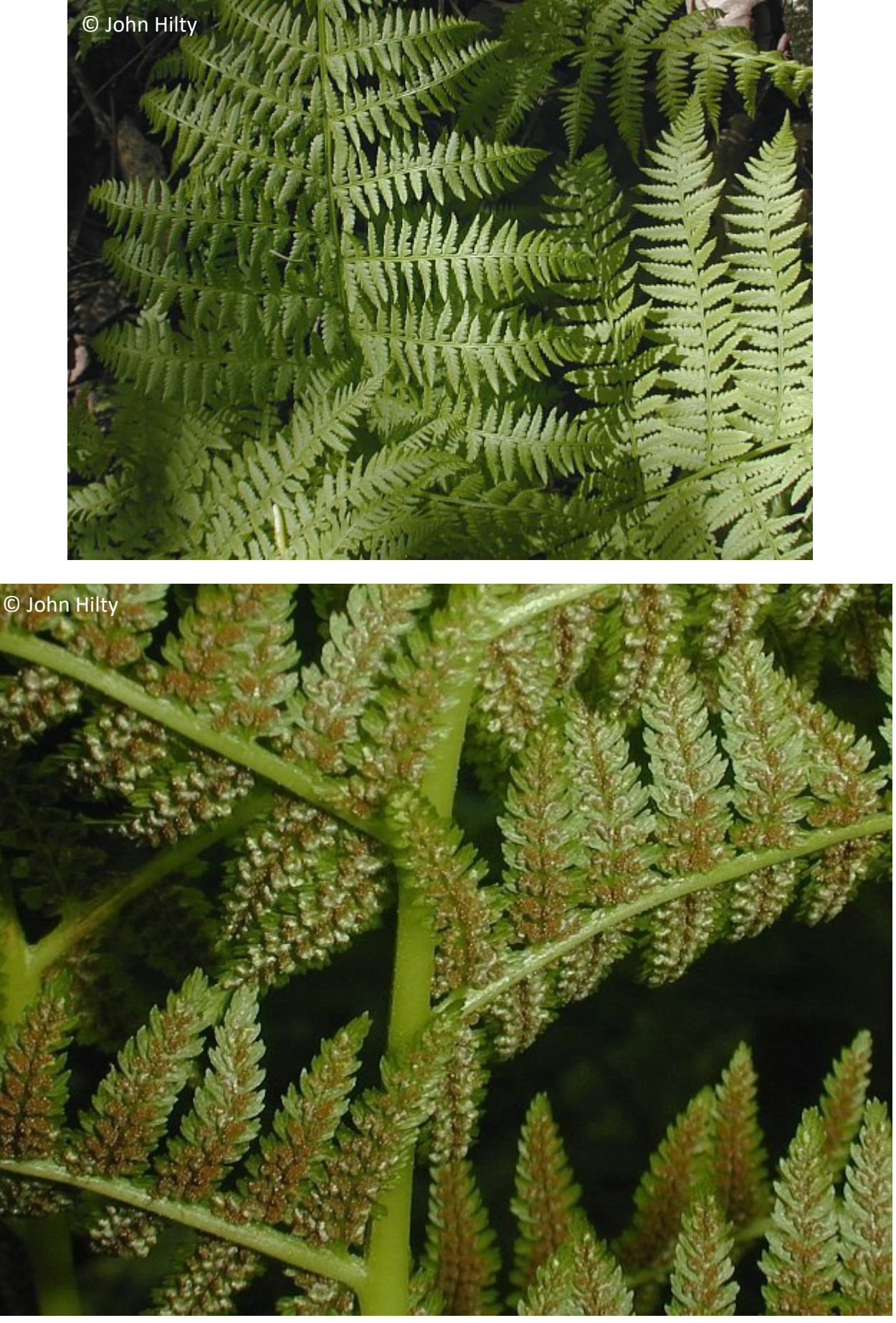
© Illinois Department of Natural Resources. 2021. Biodiversity of Illinois .