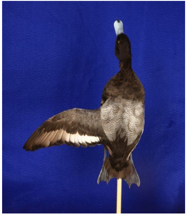
adult male preserved specimen