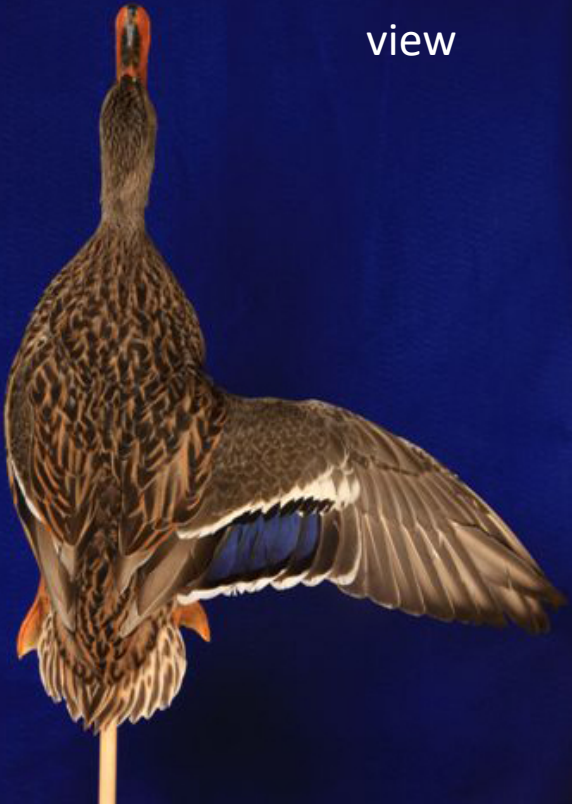
female dorsal view