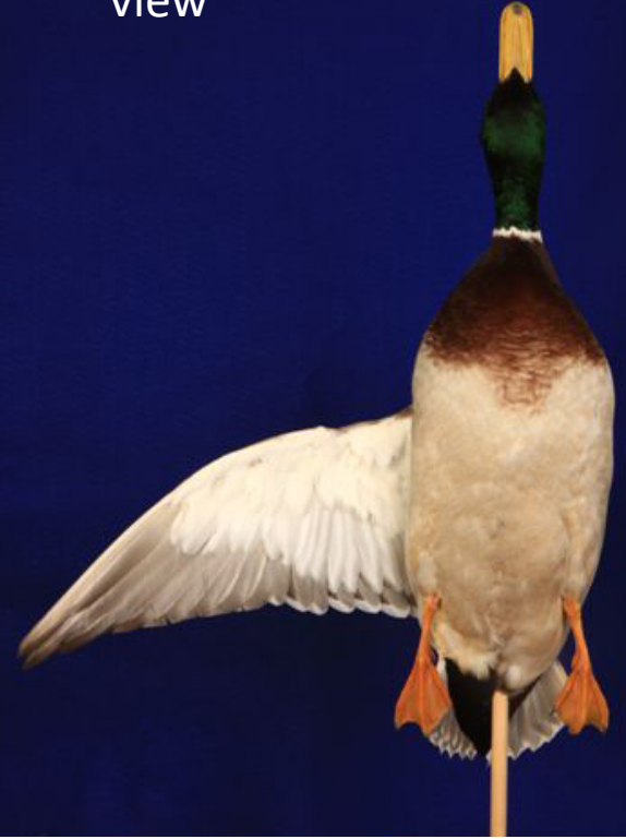
male ventral view