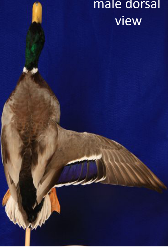
male dorsal view