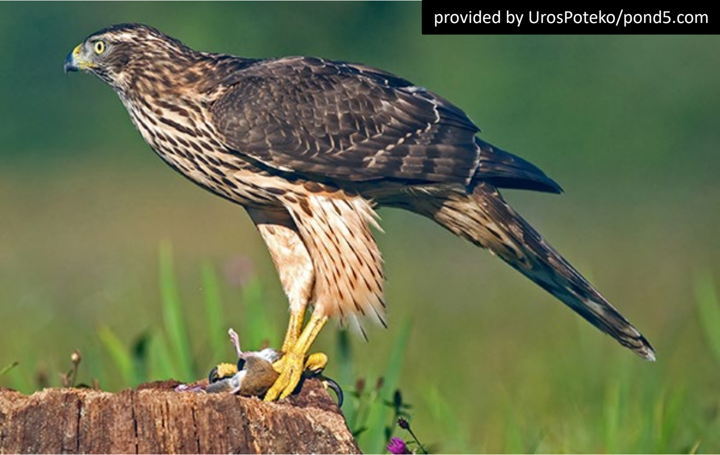
juvenile with prey