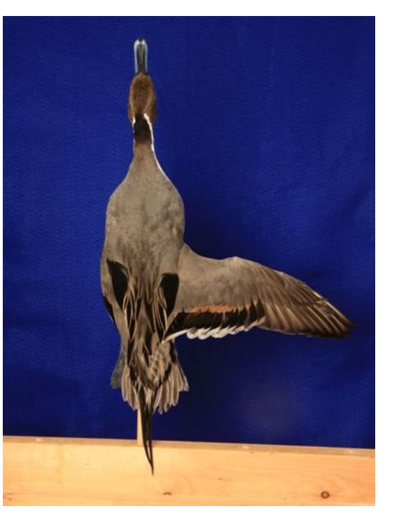
adult male preserved specimen