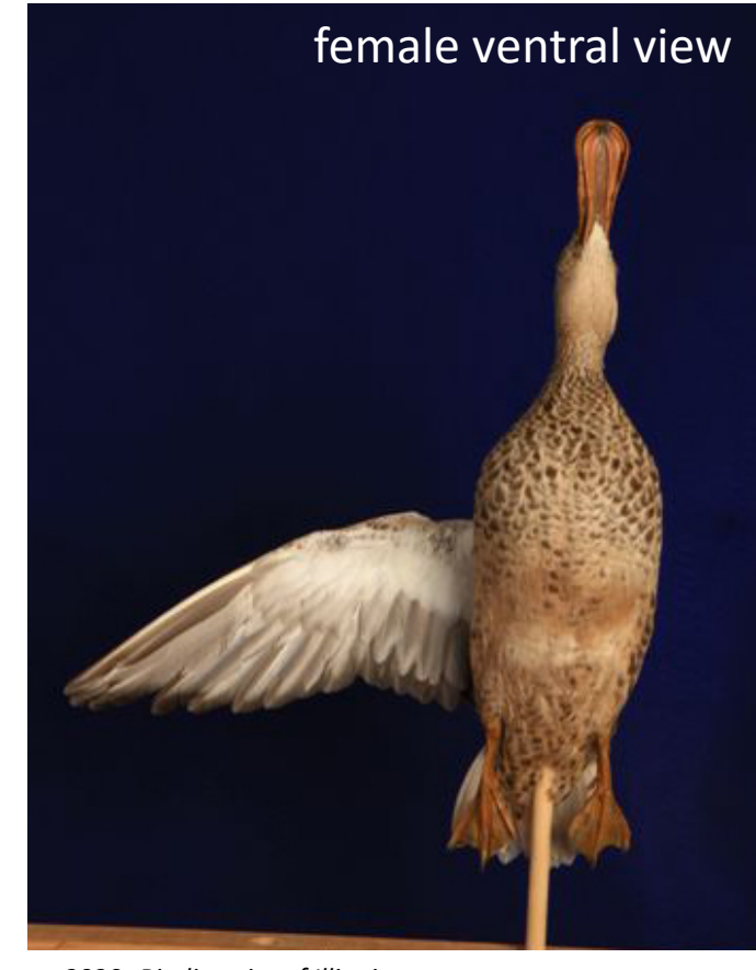
© Illinois Department of Natural Resources. 2020. Biodiversity of Illinois .