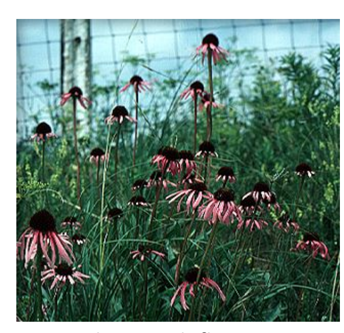
plants with flowers

Pale coneflower may be found throughout Illinois. It grows in dry to moist prairies and open woods. Flowers are produced from July through August. After the rays drop off, the seed head turns dark brown in color. Pale coneflower is an important food source for grazing animals of the prairie. Its seeds are also a source of wildlife food.