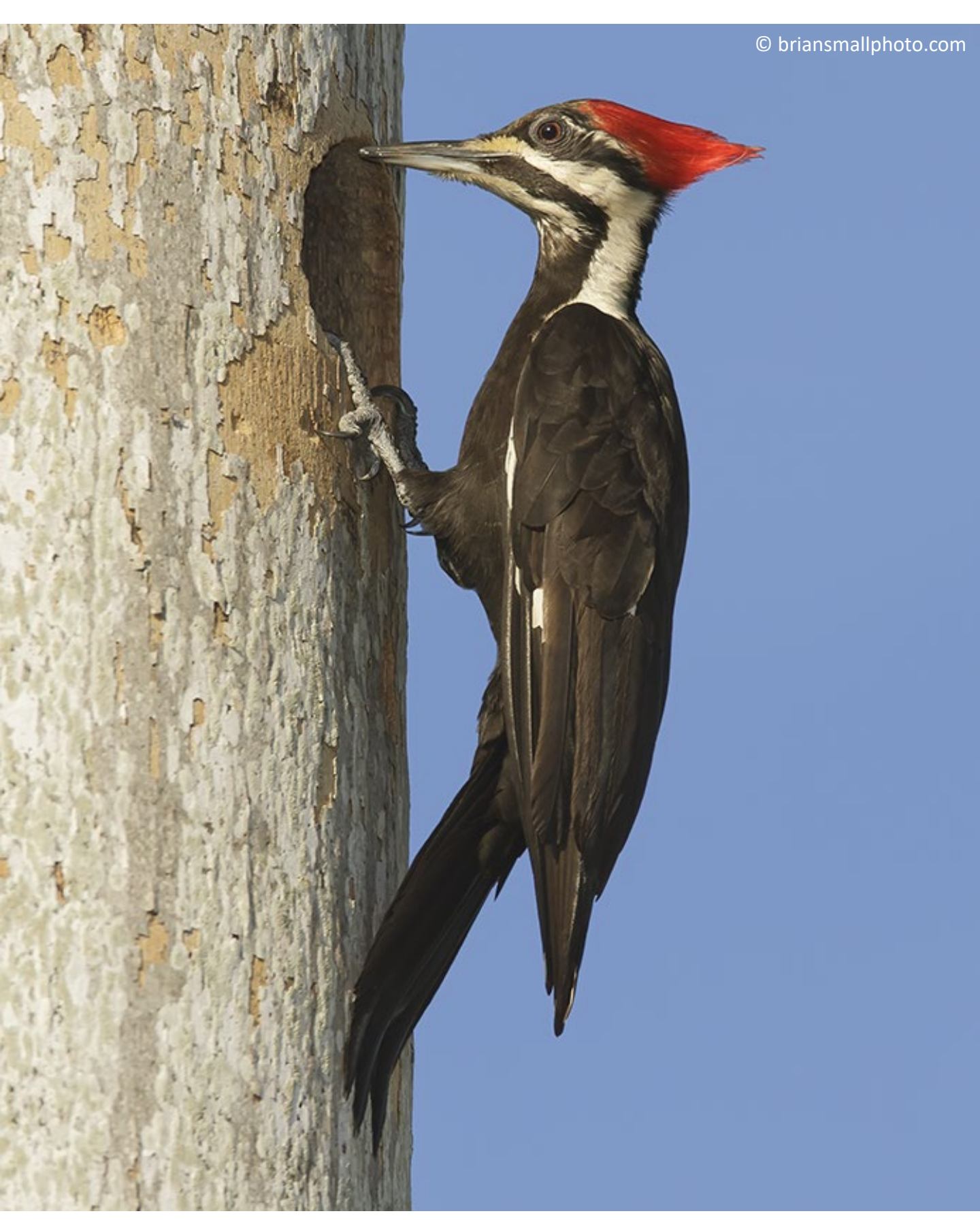
© Illinois Department of Natural Resources. 2021. Biodiversity of Illinois . Unless otherwise noted, photos and images © Illinois Department of Natural Resources.