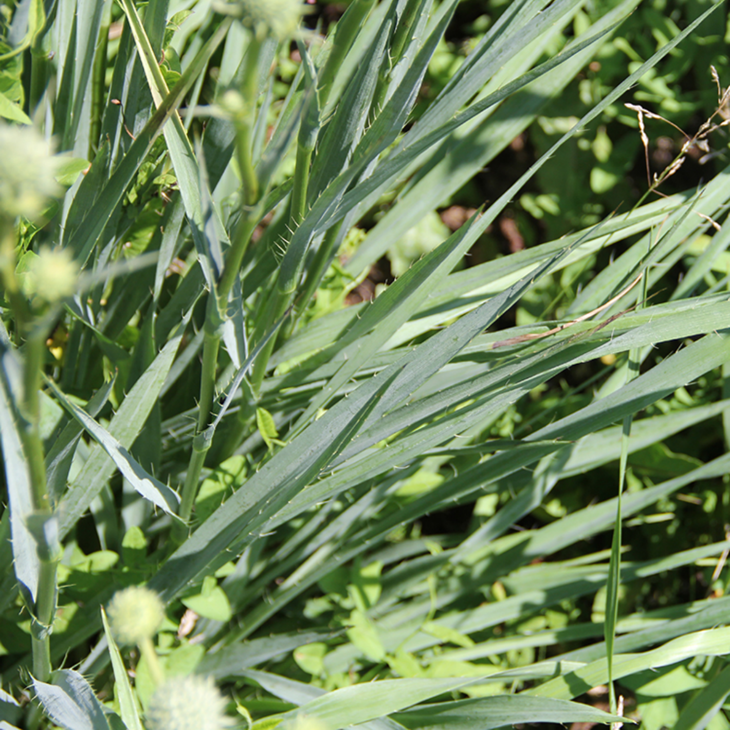
leaves and stems