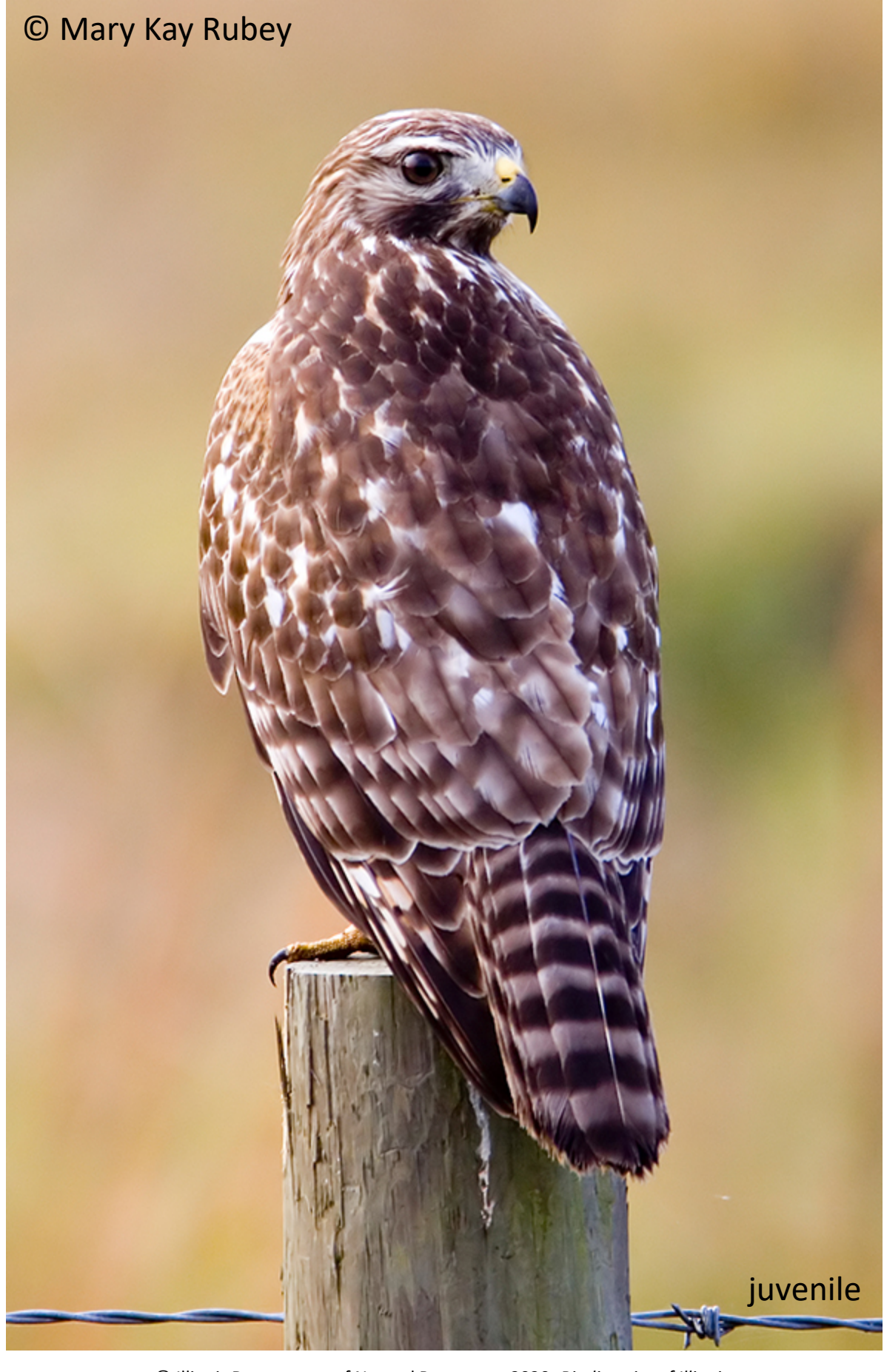
© Illinois Department of Natural Resources. 2020. Biodiversity of Illinois . Unless otherwise noted, photos and images © Illinois Department of Natural Resources.