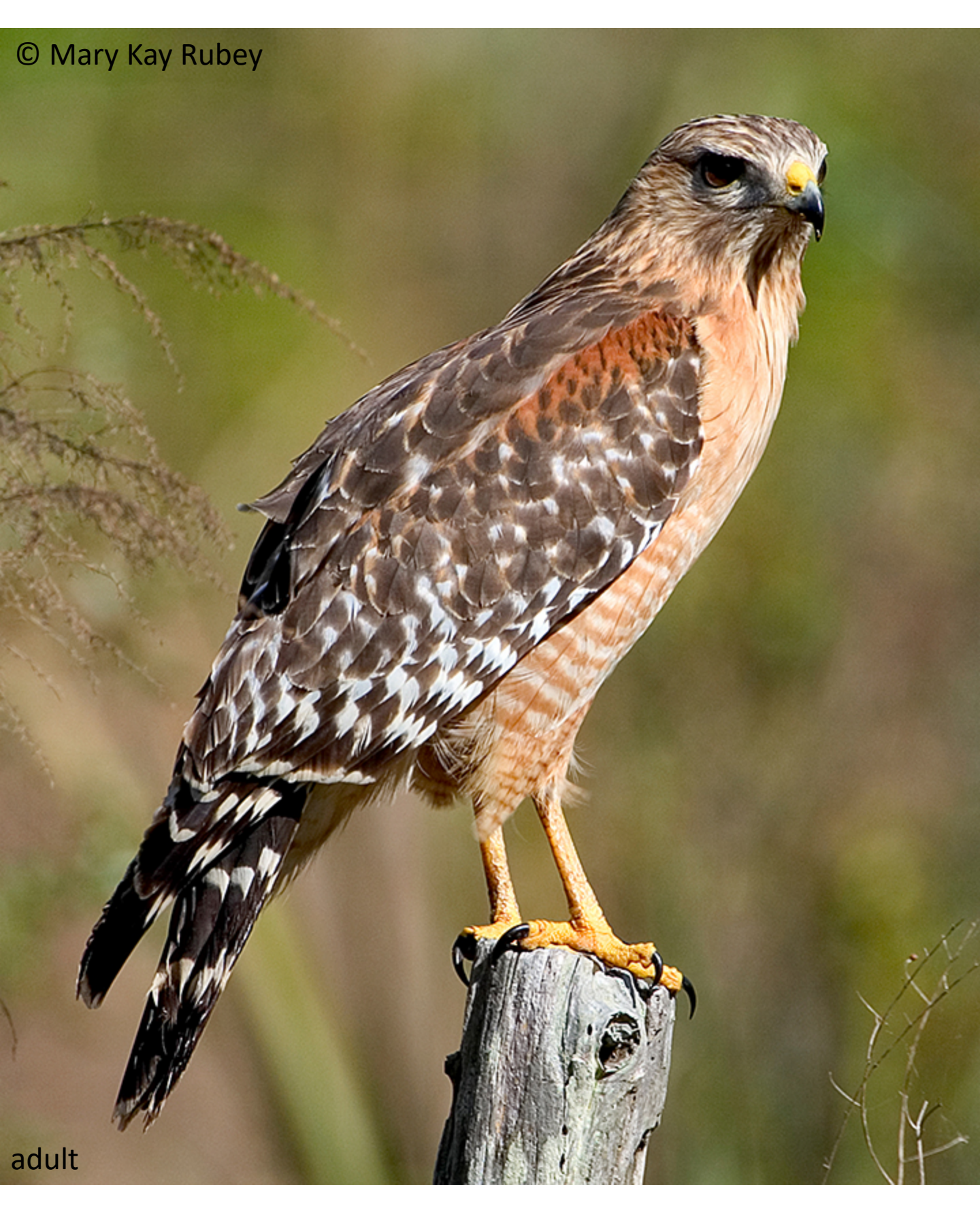
© Illinois Department of Natural Resources. 2020. Biodiversity of Illinois .