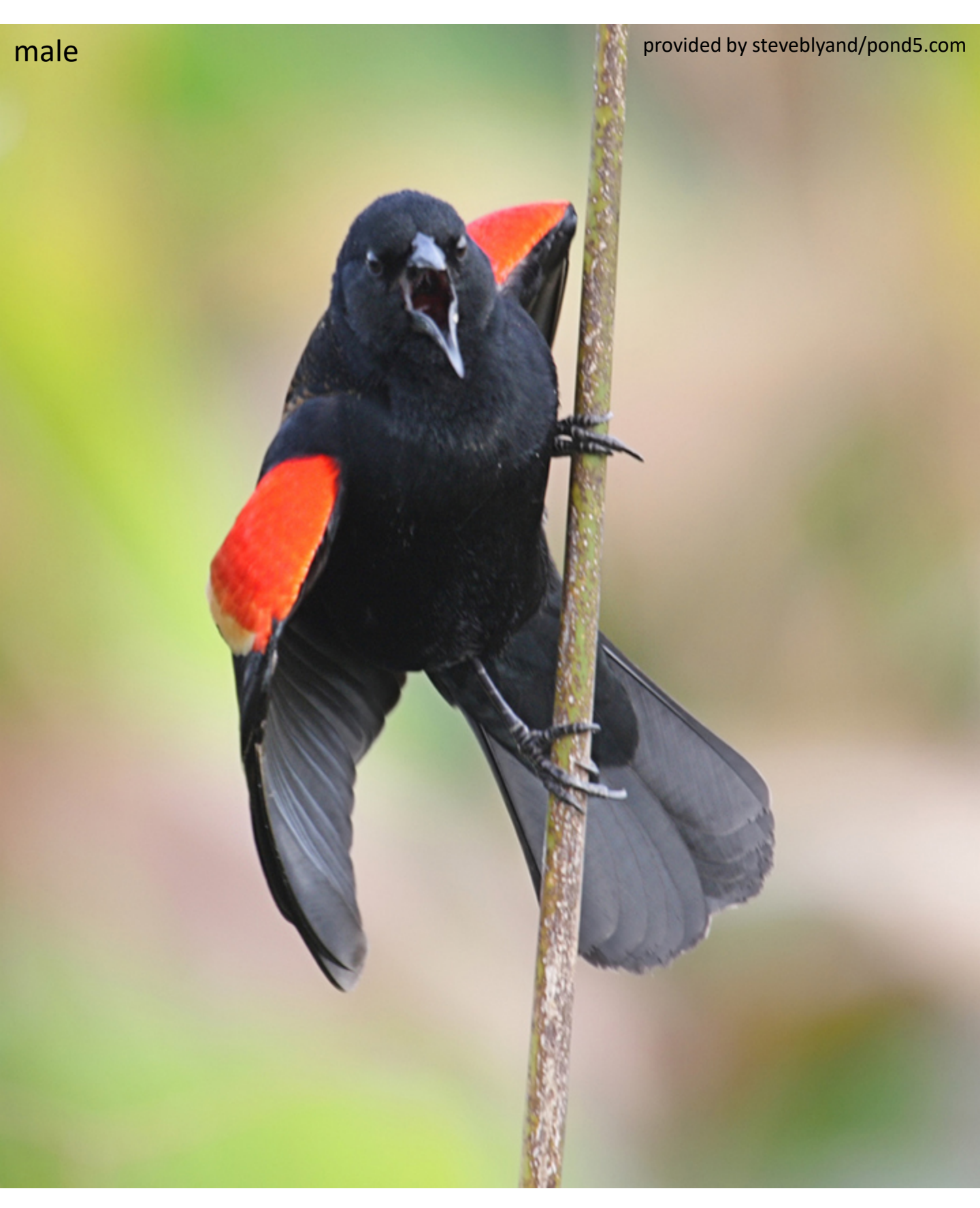
© Illinois Department of Natural Resources. 2021. Biodiversity of Illinois . Unless otherwise noted, photos and images © Illinois Department of Natural Resources.