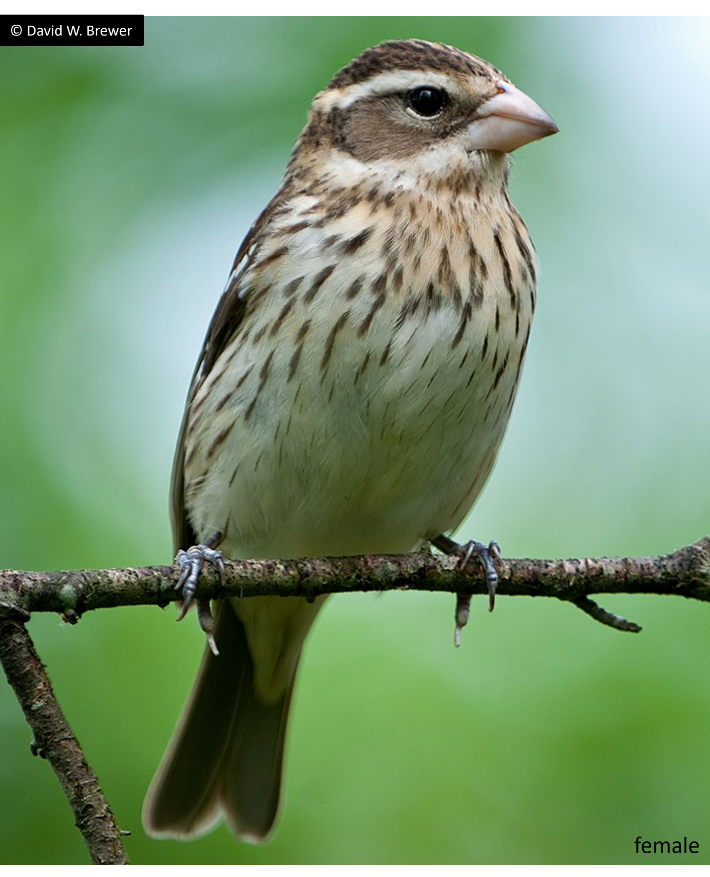
© Illinois Department of Natural Resources. 2024. Biodiversity of Illinois .