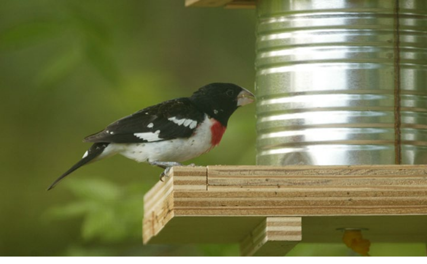
adult male at feeder