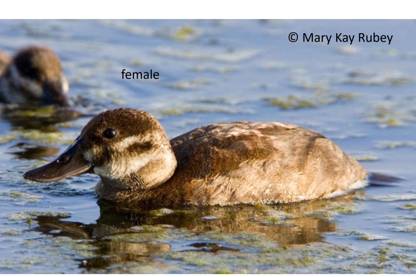
© Illinois Department of Natural Resources. 2020. Biodiversity of Illinois . Unless otherwise noted, photos and images © Illinois Department of Natural Resources.