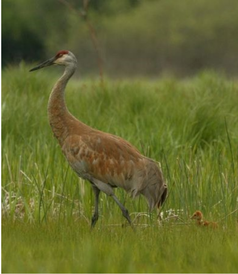
adult with chick