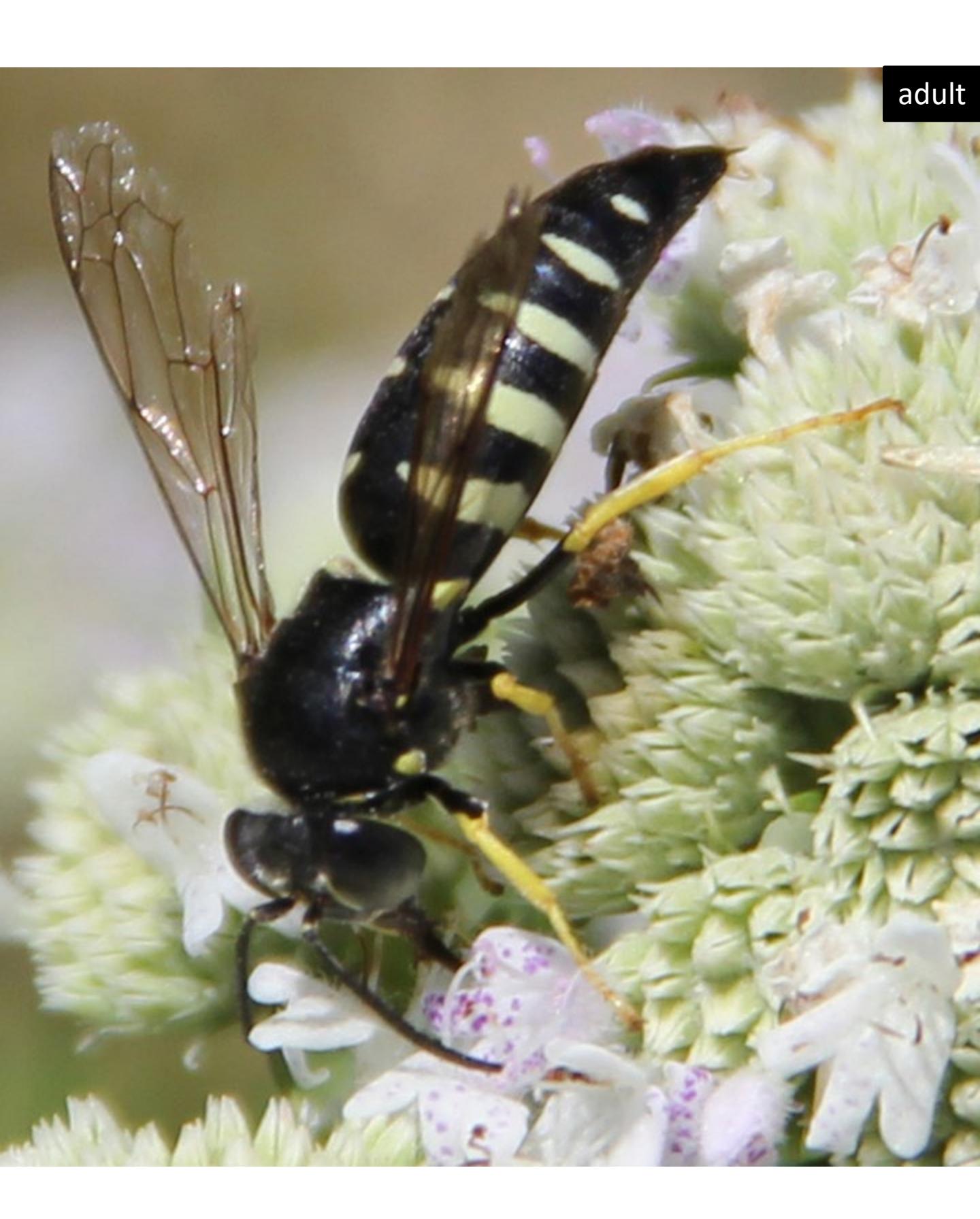
© Illinois Department of Natural Resources. 2025. Biodiversity of Illinois .