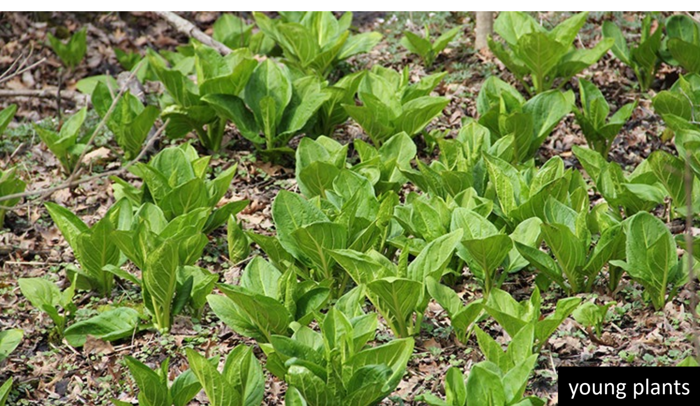
© Illinois Department of Natural Resources. 2025. Biodiversity of Illinois . Unless otherwise noted, photos and images © Illinois Department of Natural Resources.