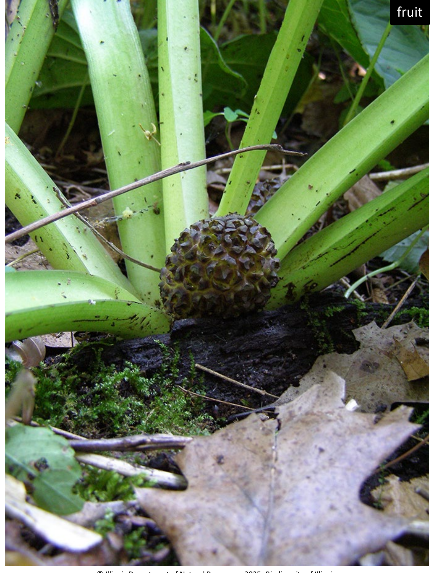
© Illinois Department of Natural Resources. 2025. Biodiversity of Illinois . Unless otherwise noted, photos and images © Illinois Department of Natural Resources.