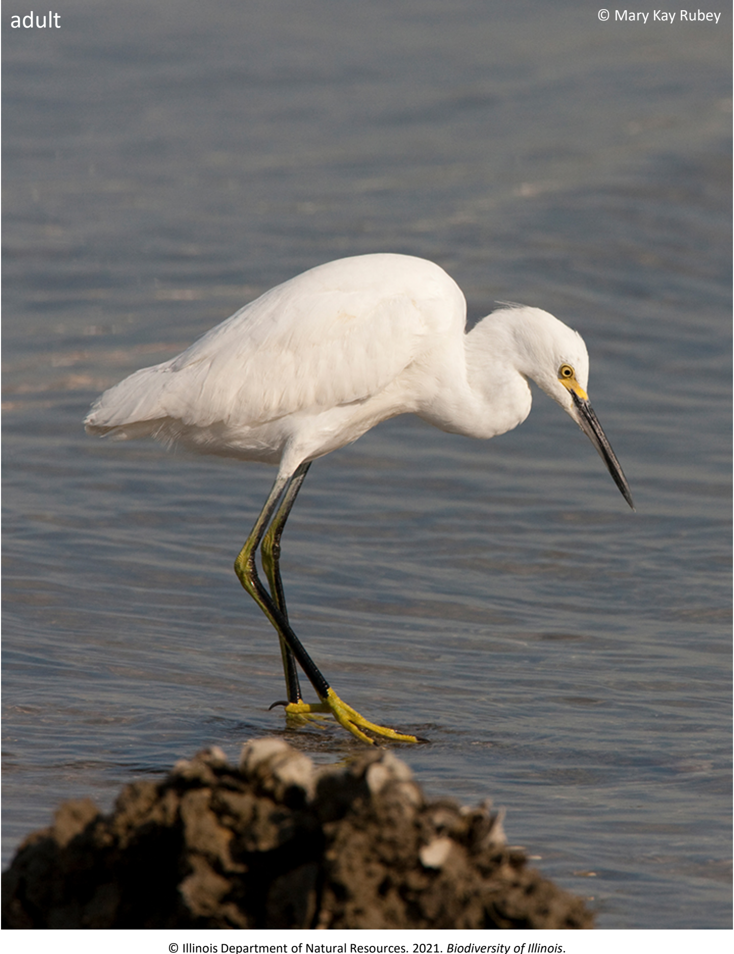
© Illinois Department of Natural Resources. 2021. Biodiversity of Illinois . Unless otherwise noted, photos and images © Illinois Department of Natural Resources.