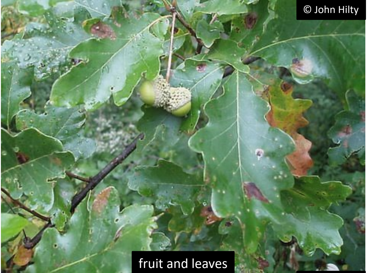
fruit and leaves