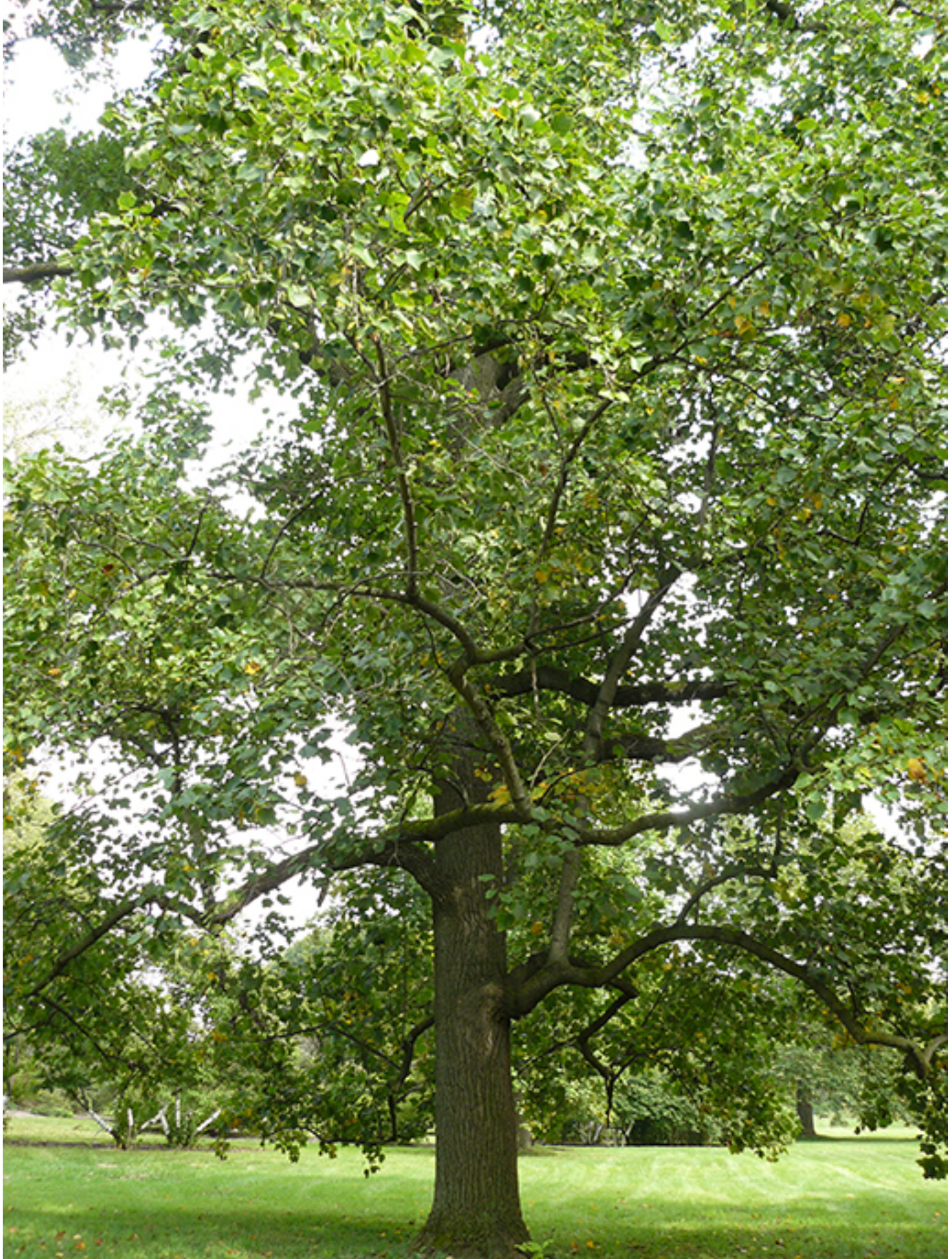
© Illinois Department of Natural Resources. 2020. Biodiversity of Illinois .