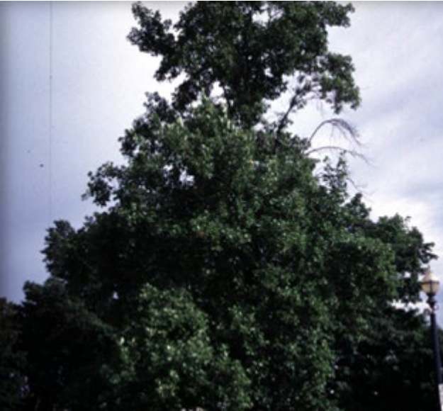
tree in summer