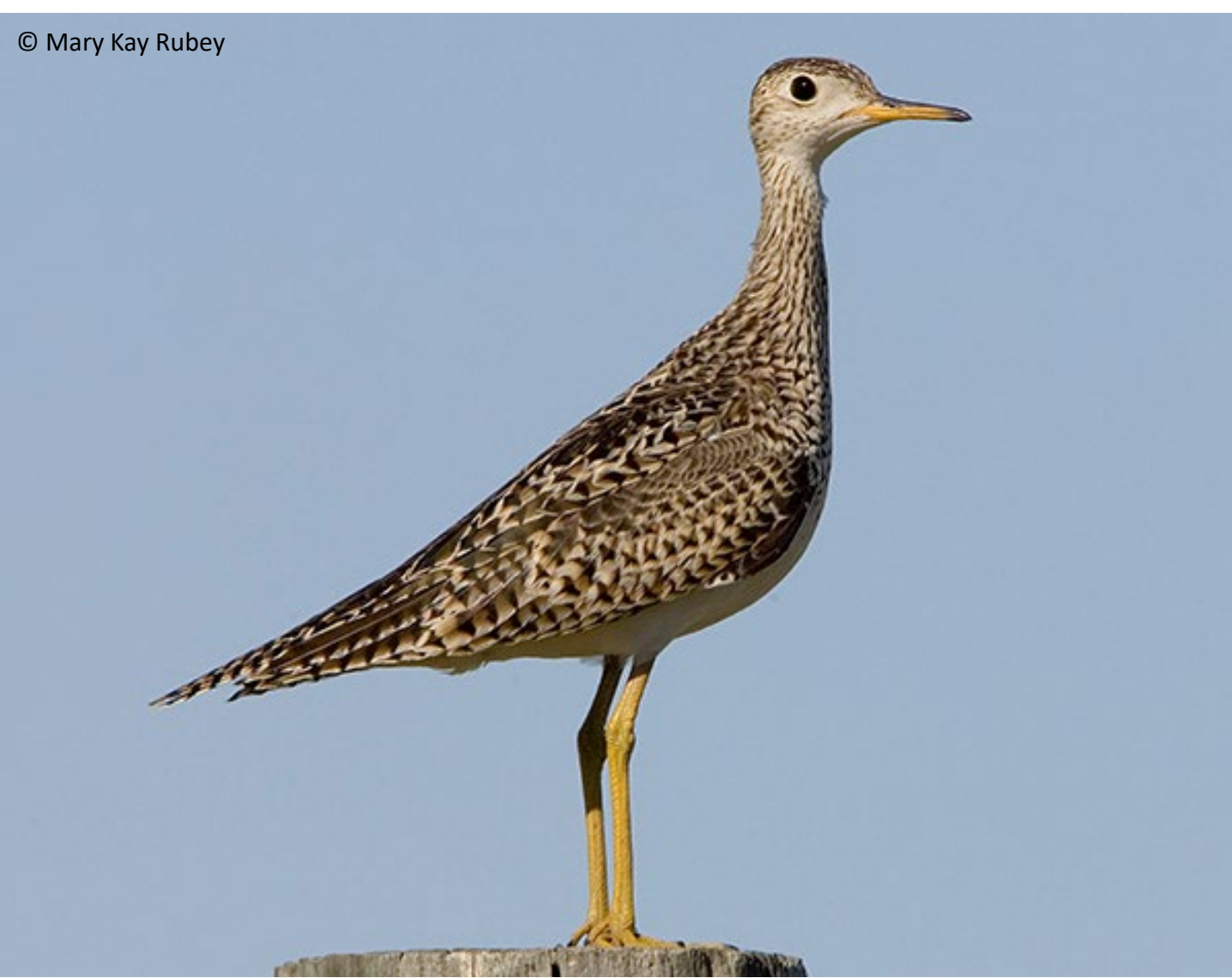
© Illinois Department of Natural Resources. 2020. Biodiversity of Illinois . Unless otherwise noted, photos and images © Illinois Department of Natural Resources.