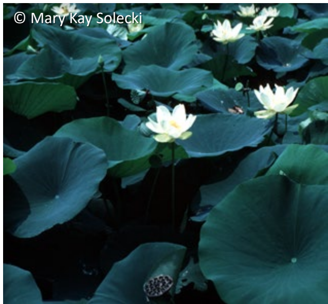
leaves and flowers