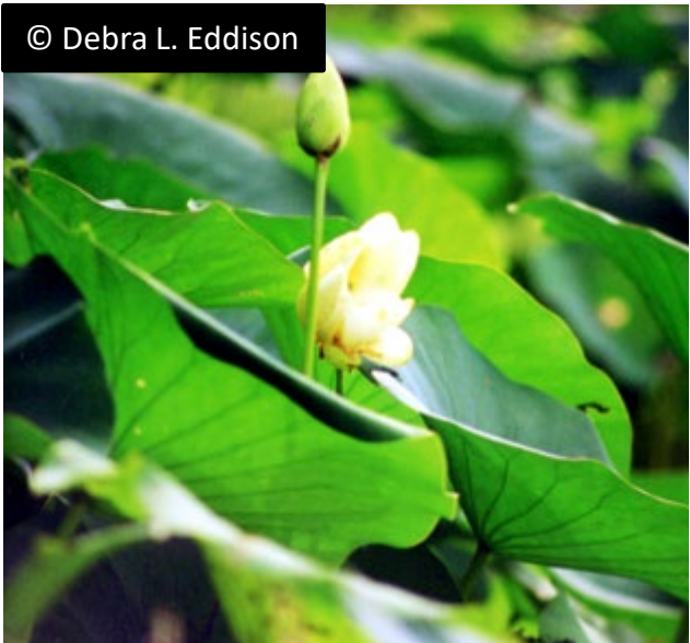
bud, flowers, leaves