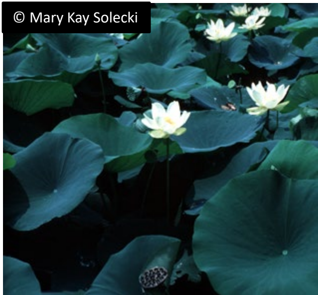
leaves and flowers